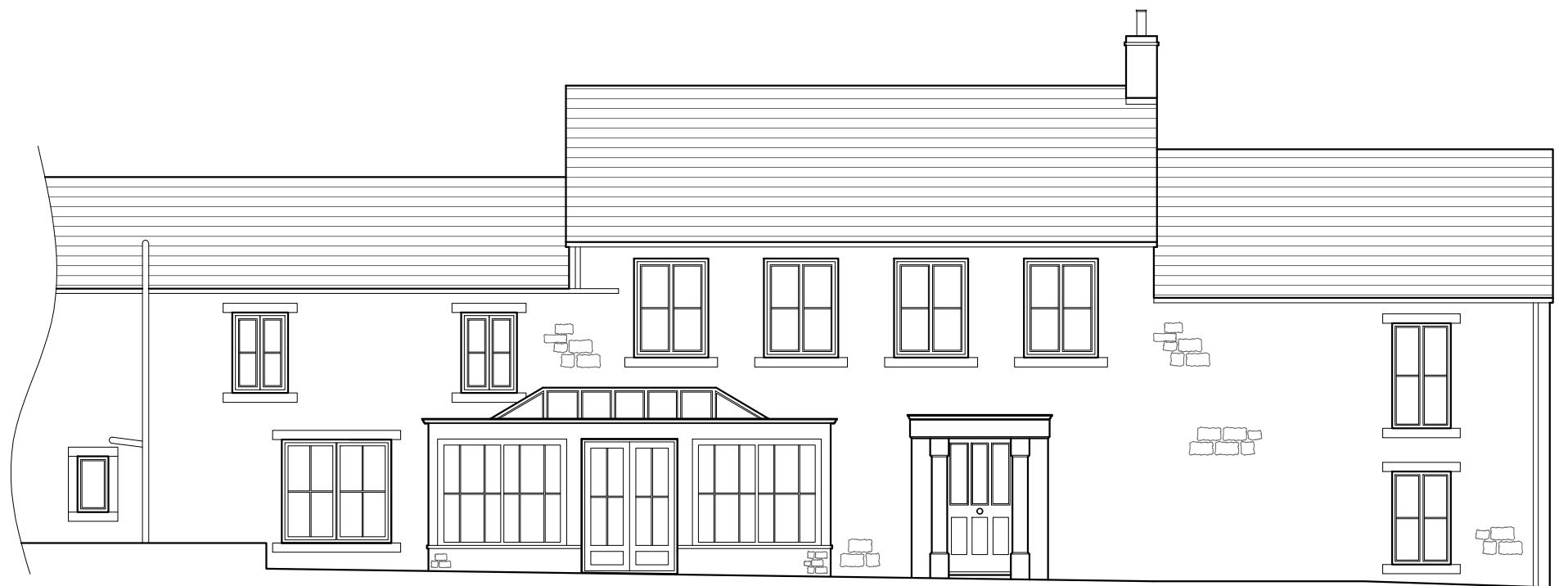
WEST FACING ELEVATION SCALE 1:100