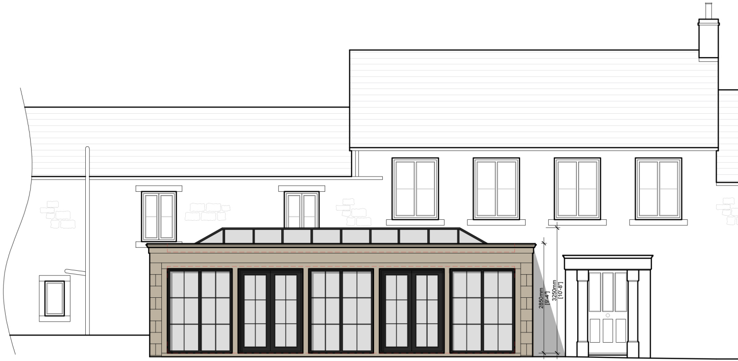
WEST FACING ELEVATION SCALE 1:100