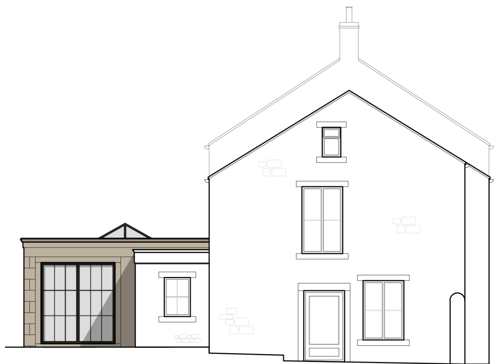
SOUTH FACING ELEVATION SCALE 1:100