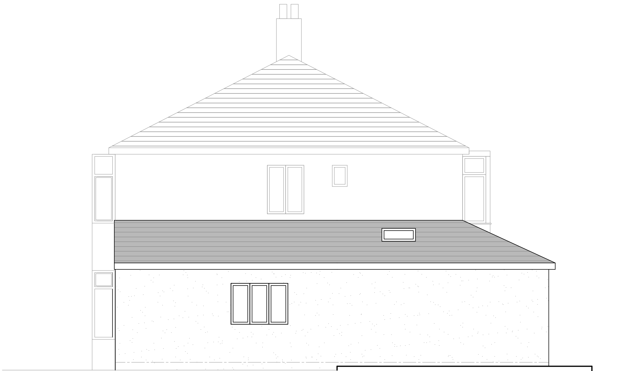
SIDE ELEVATION (1)