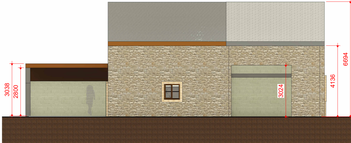
2 EXISTING EAST ELEVATION 1 : 50