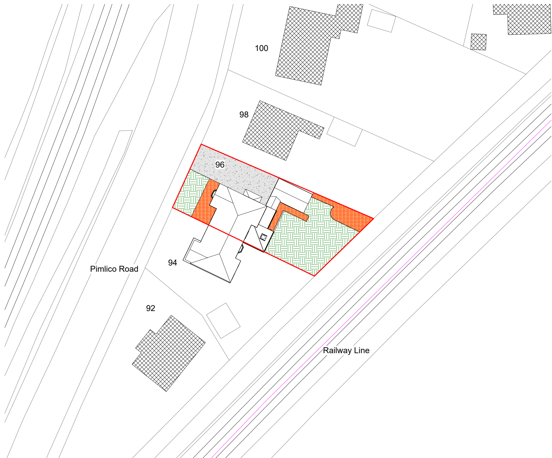
1 PROPOSED SITE PLAN 1 : 200