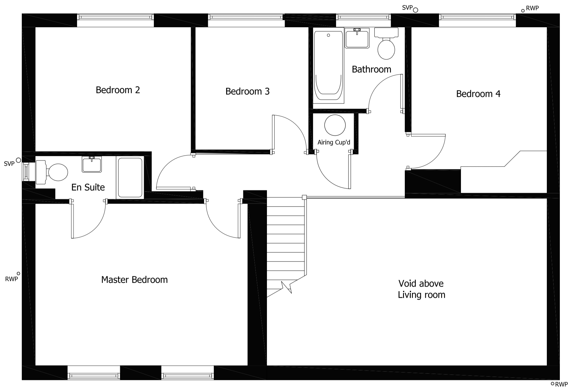
02 FIRST FLOOR GA PLAN AS EXISTING 1:50