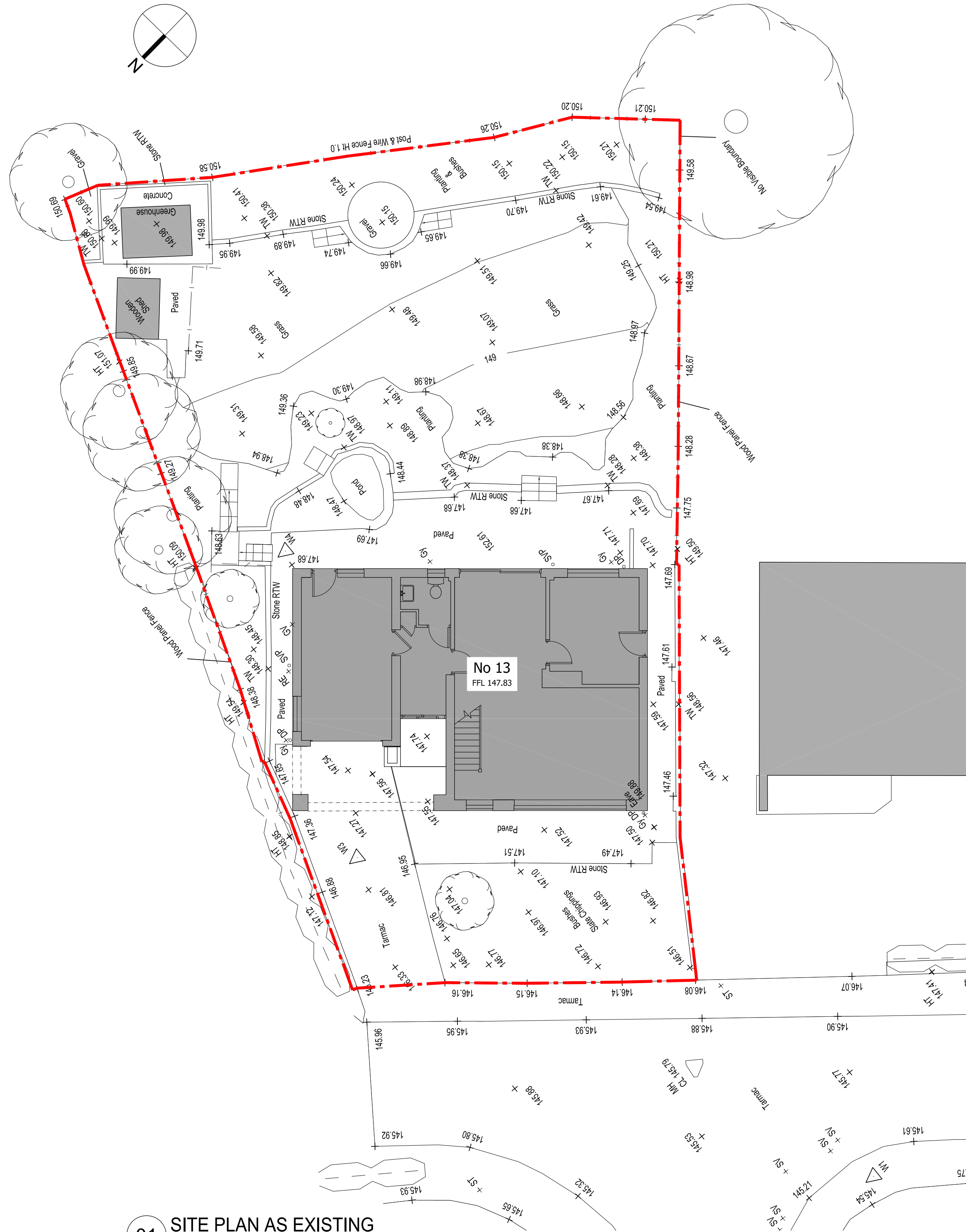
01 SITE PLAN AS EXISTING 1:100

DRAWING PRODUCED FOR PLANNING PURPOSES ONLY. NOT TO BE USED FOR ANY OTHER PURPOSE