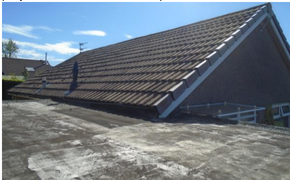
Tile pitched and felt flat roofs.

The house has a pitched roof with tile finish, upvc fascia's, barge boards and soffits. The garage roof is flat with a bitumen felt finish and upvc fascia's flush to the wall. The conservatory roof is clear polycarbonate sheet with upvc frame.