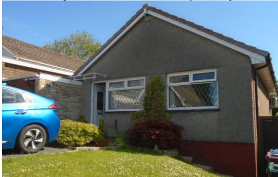
South west front elevation

The property is a detached Bungalow with attached garage which adjoins the neighbouring garage. There is a conservatory to the rear. The house probably dates from the 1960's / 1970's.