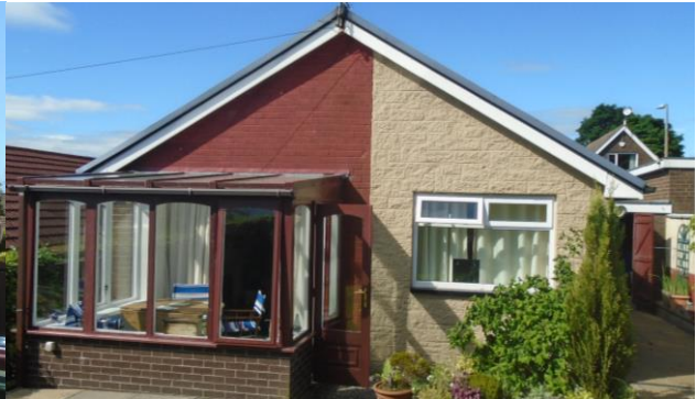
North east rear elevation