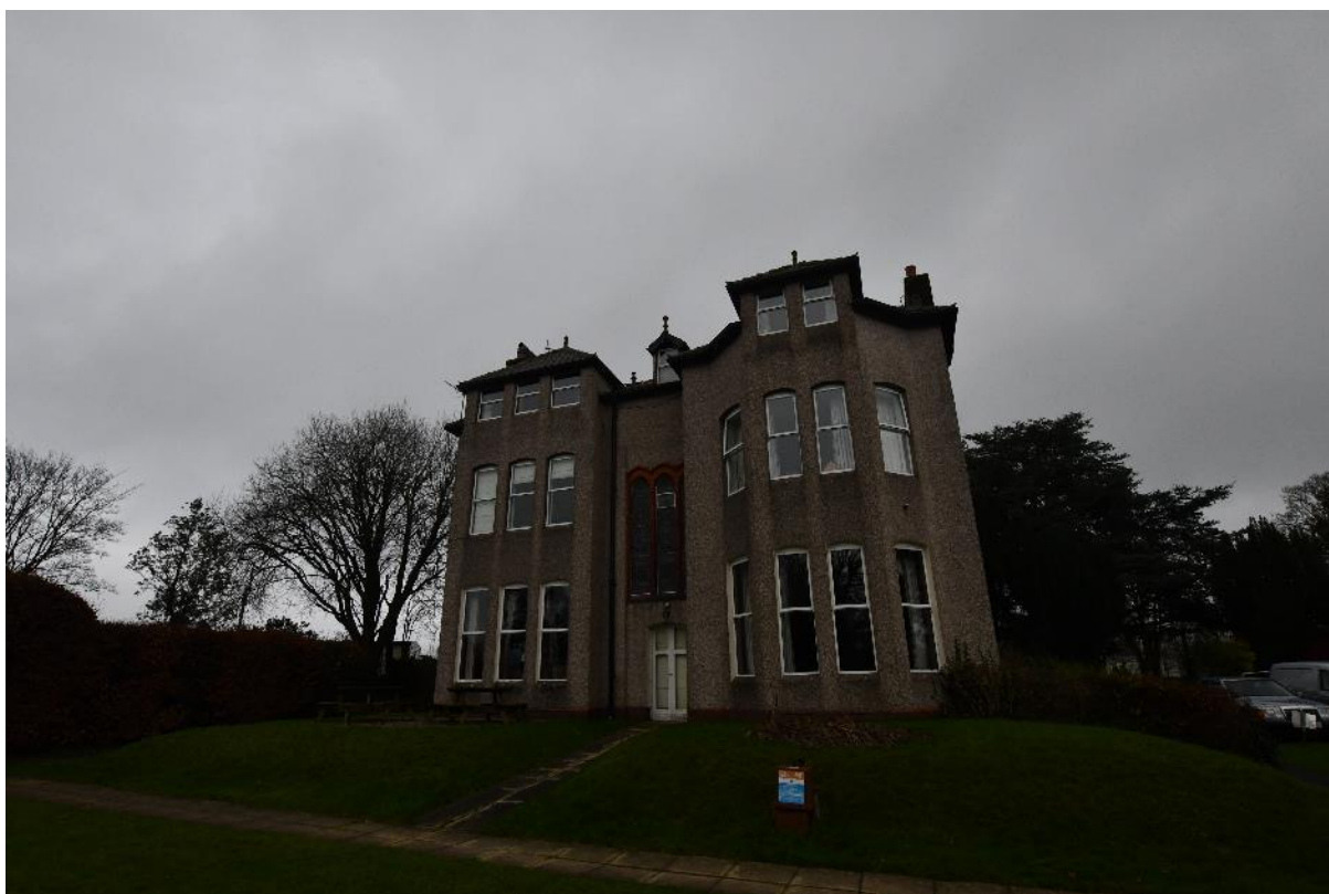
Image 6 Lodge House from North