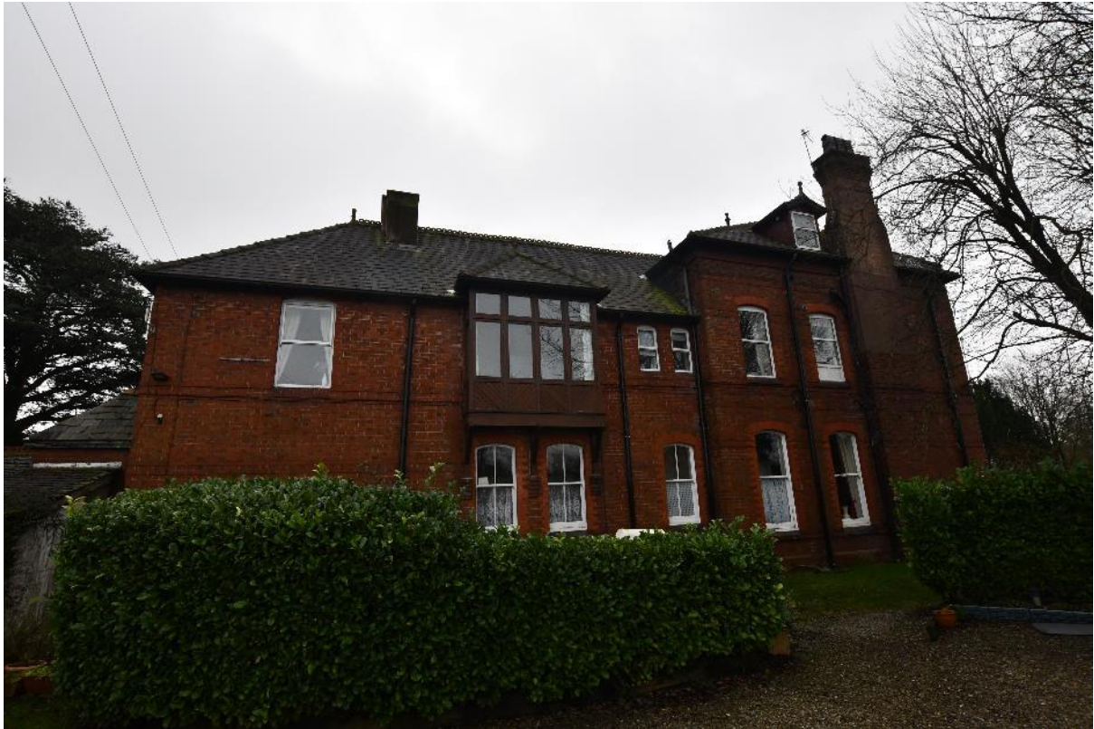
Image 7 Lodge House from east