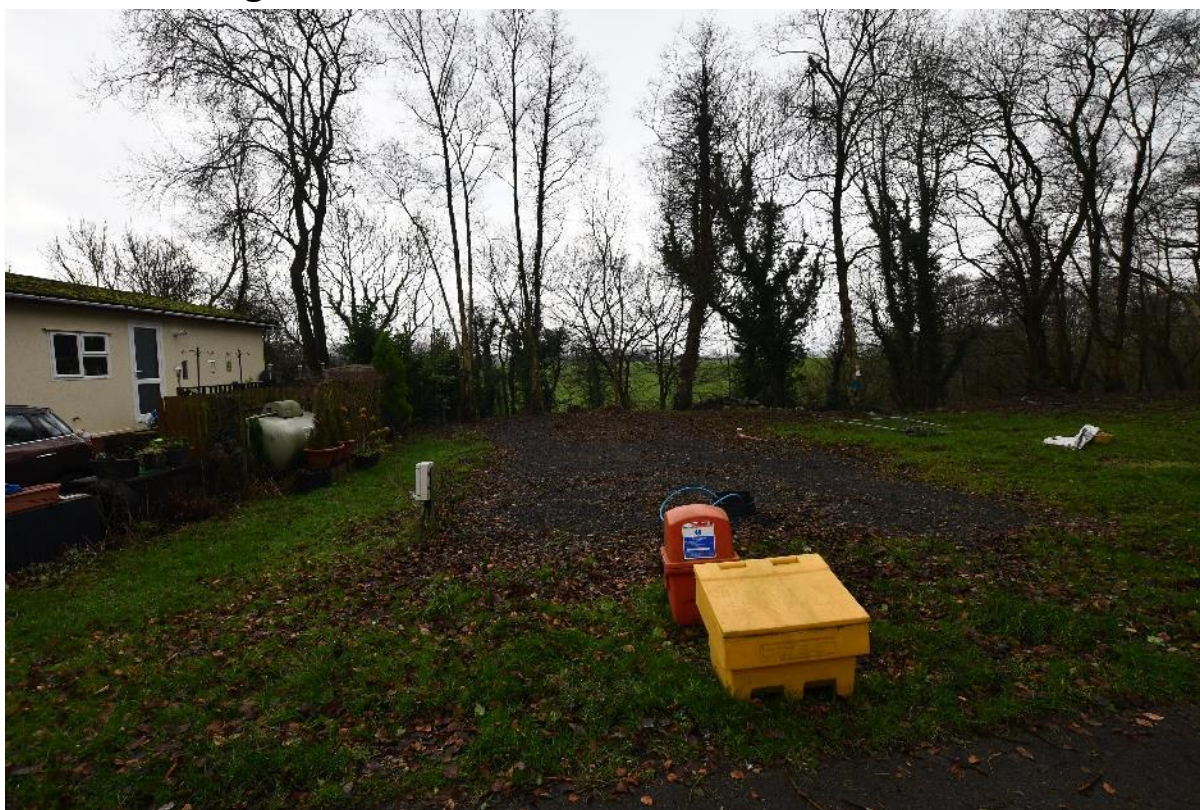
Image 1 looking towards woodland showing gravel hardstanding