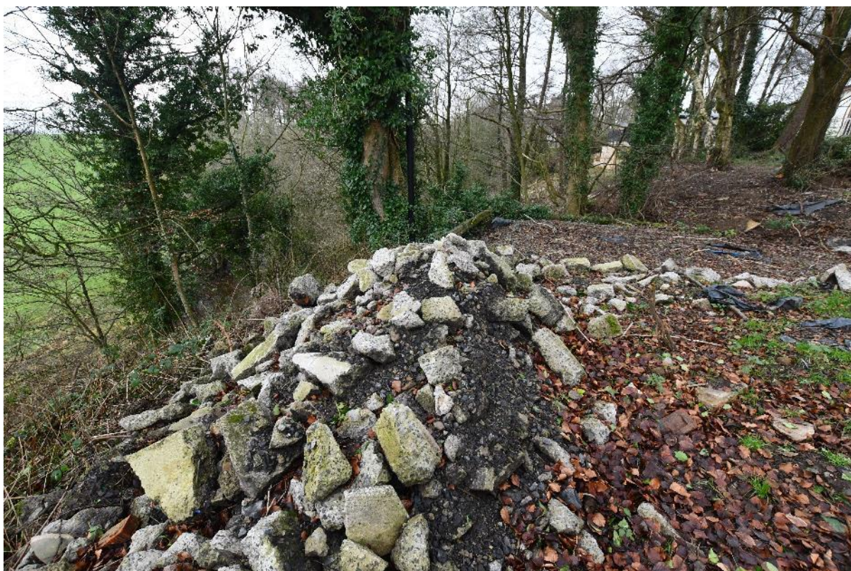
Image 3 Rubble Pile on edge of site