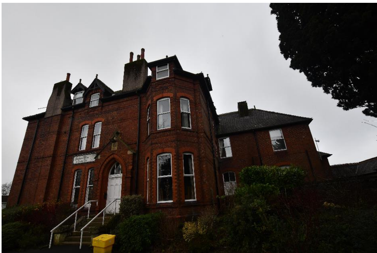
Image 5 Large Lodge House from west