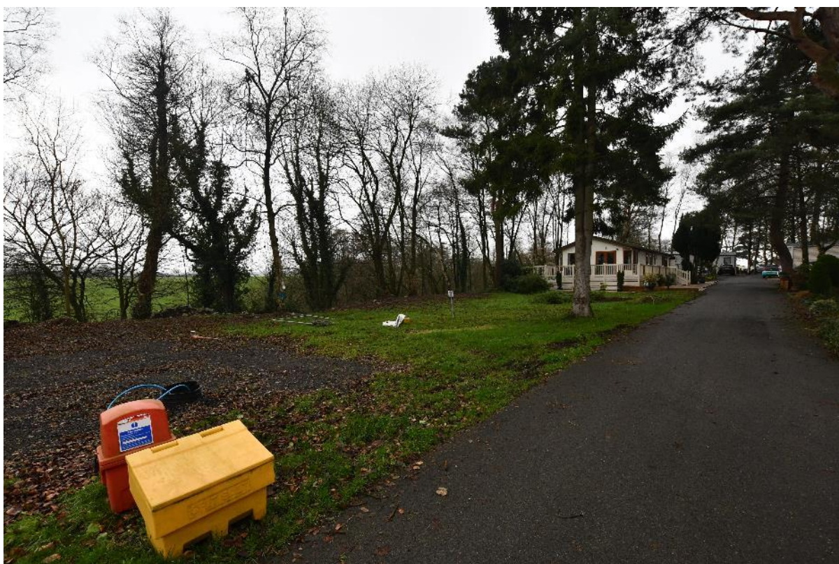
Image 2 Looking North across site showing infrastructure