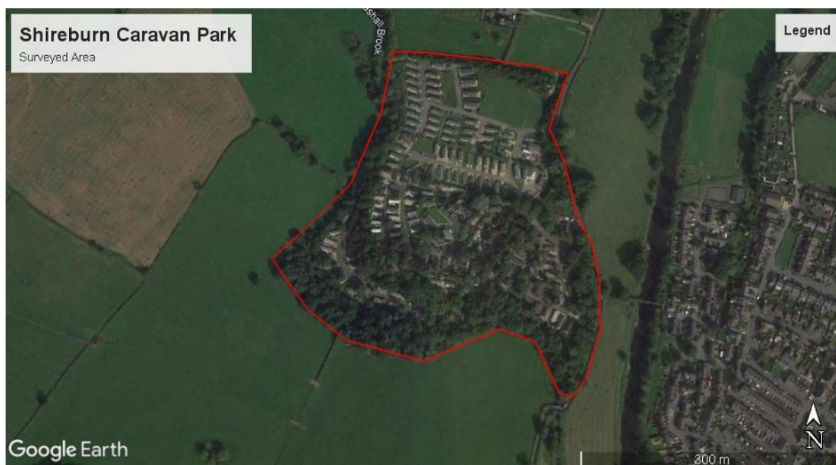
FIGURE 1. Surveyed Area indicated by the red line above.

2.2: Bombus Ecology was commissioned to carry out a Preliminary Ecological Appraisal/Bat Risk Assessment of the Shireburn Caravan Park, in order to identify the current ecological value of the site and any potential issues that will need to be mitigated or compensated for as a result of the planned works, , as well as providing the basis for a suite of ecological habitat enhancement which is a key aim of the project.