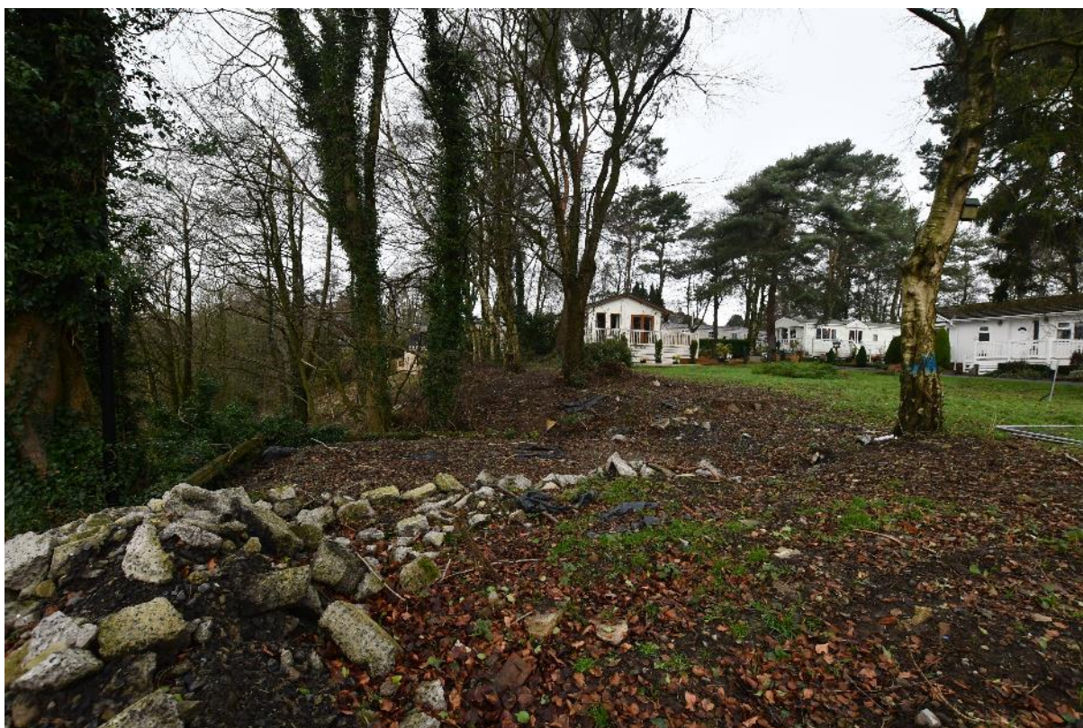
Image 4 Looking north across site from rubble pile