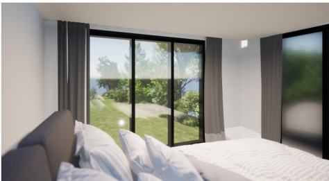
Above: View of Bedroom 4