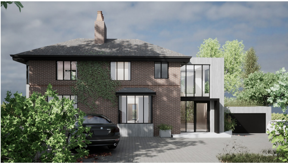
Above: View of Proposed Front Frontage and Garage