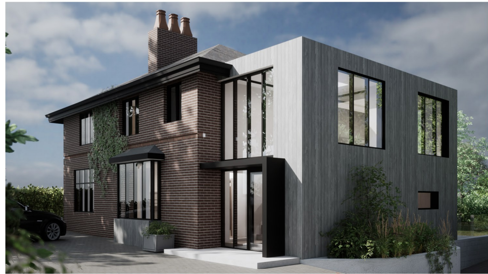
Above: View of New Main Entrance