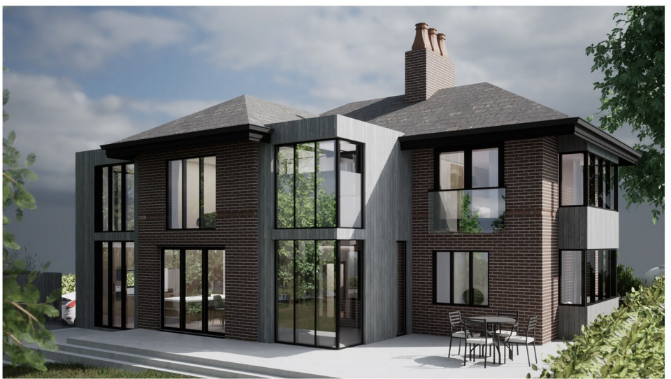
Above: Rear View of Proposed Extension