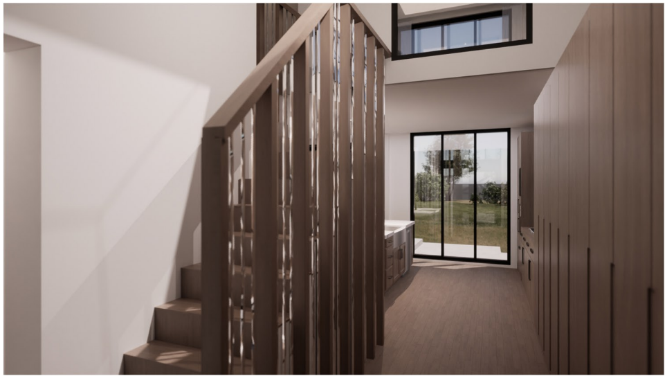
Above: View New Main Entrance Lobby and Stair