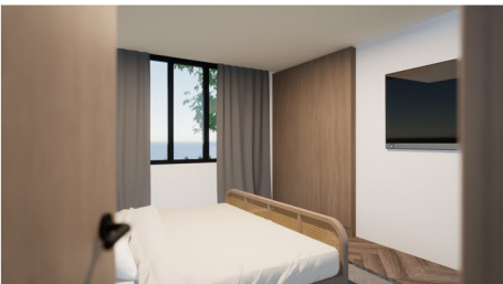
Above: View of Bedroom 2