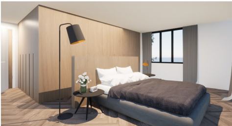
Above: View of Bedroom 3