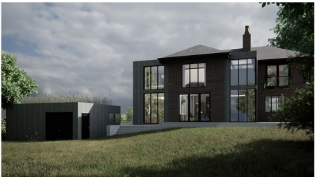
Above: View of Proposed Rear