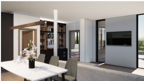
Above: View of Living Room

NB: ALL DRAWINGS SUBJECT TO FURTHER DETAIL AND ALL LOCAL AUTHORITY APPROVALS.