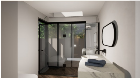
Above: View of Bedroom 3 En-Suite