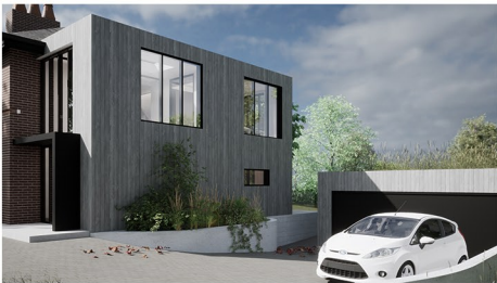
Above: View of Proposed Garage