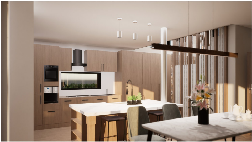
Above: Internal View of Kitchen