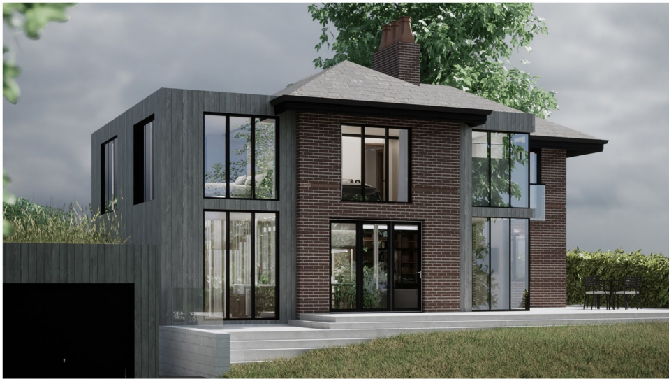
Above: Rear View of Proposed Extension