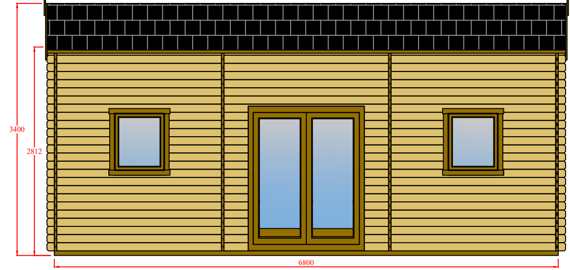
ELEVATION 2 (FRONT)