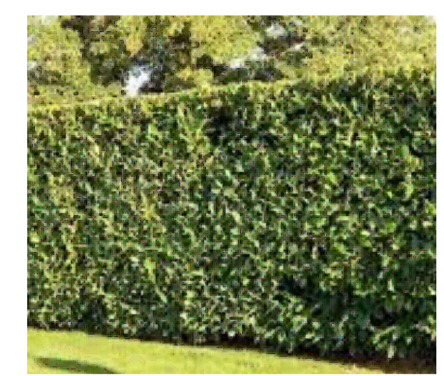
Mature Native Hedgerow

Red dashed line indicates the extent of the removed double garage