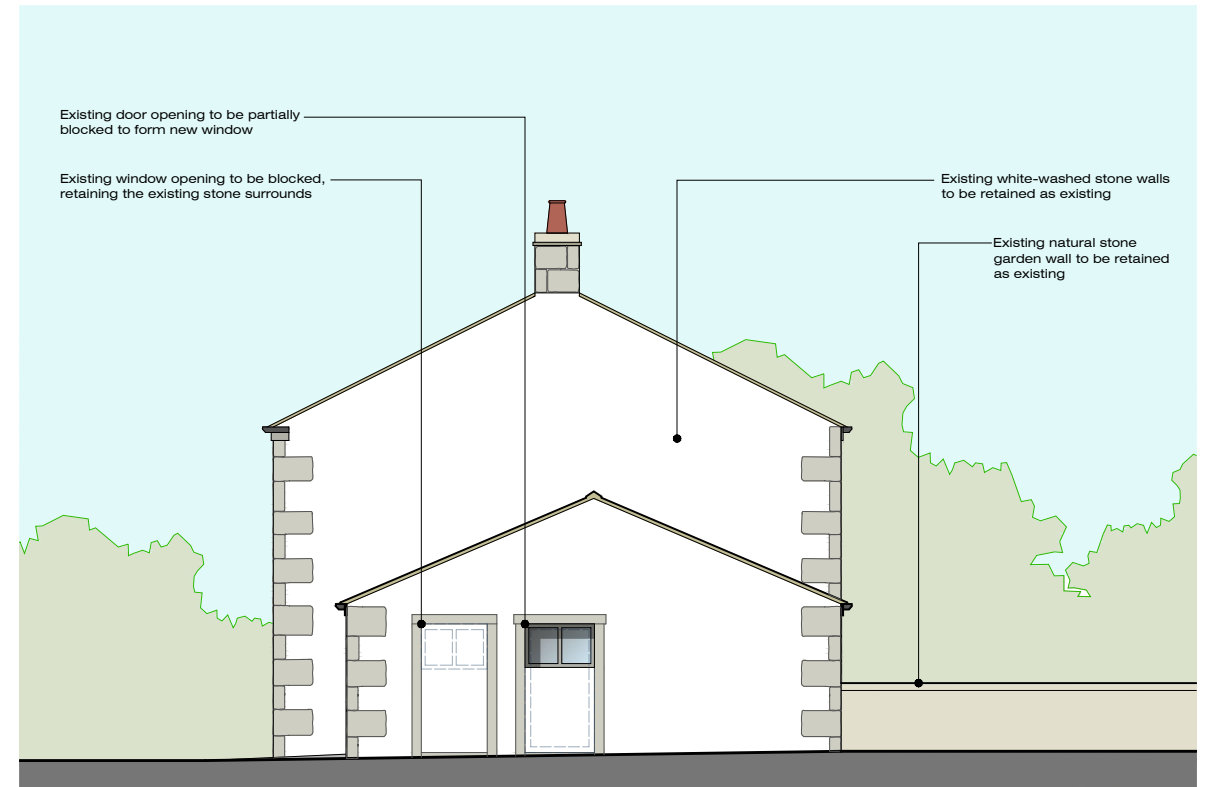
Side (North-East) Elevation