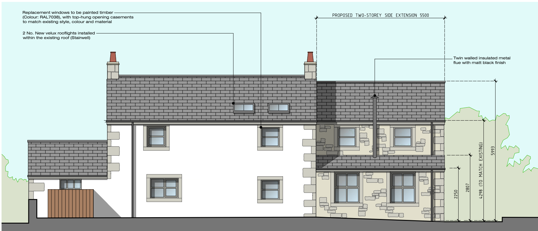
Rear (North-West) Elevation