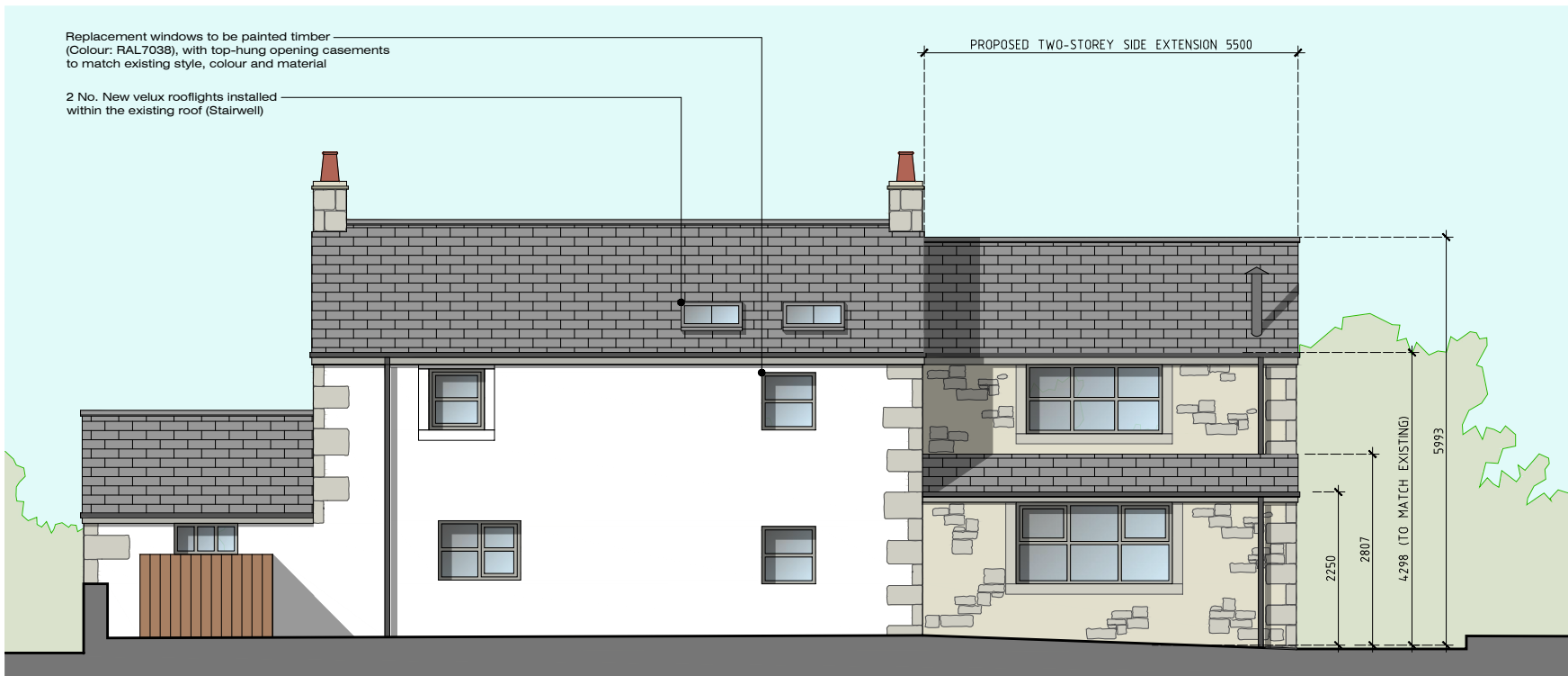
Rear (North-West) Elevation