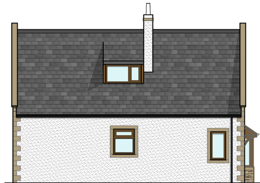
PROPOSED WEST FACING ELEVATION SCALE 1:100