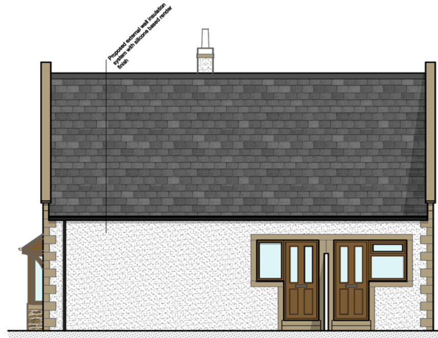
PROPOSED EAST FACING ELEVATION SCALE 1:100