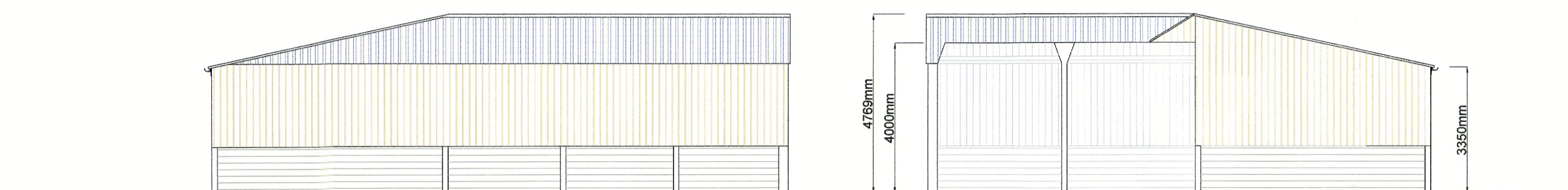
REAR ELEVATION ( Existing - North, Proposed - West )