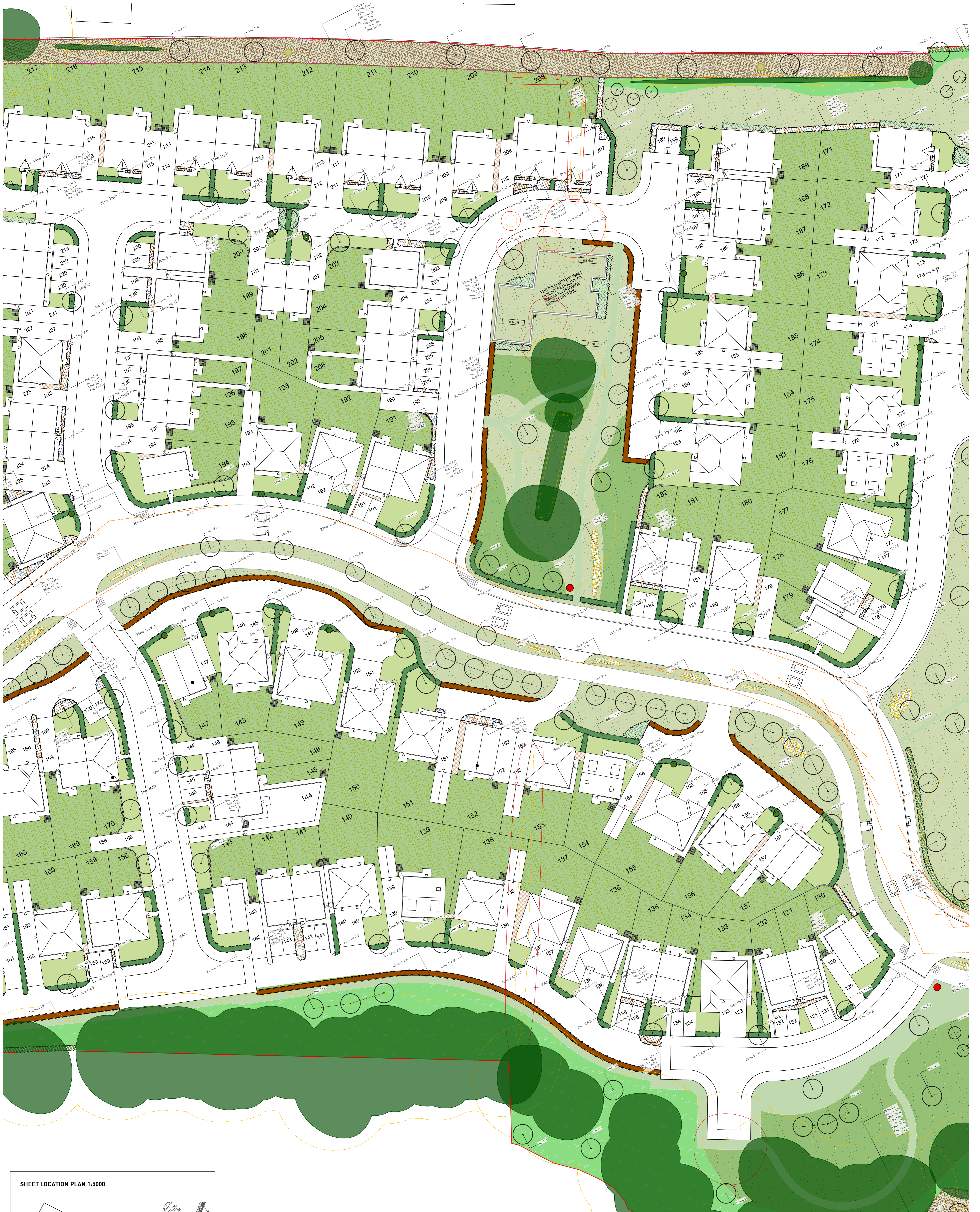
SHEET LOCATION PLAN 1:5000