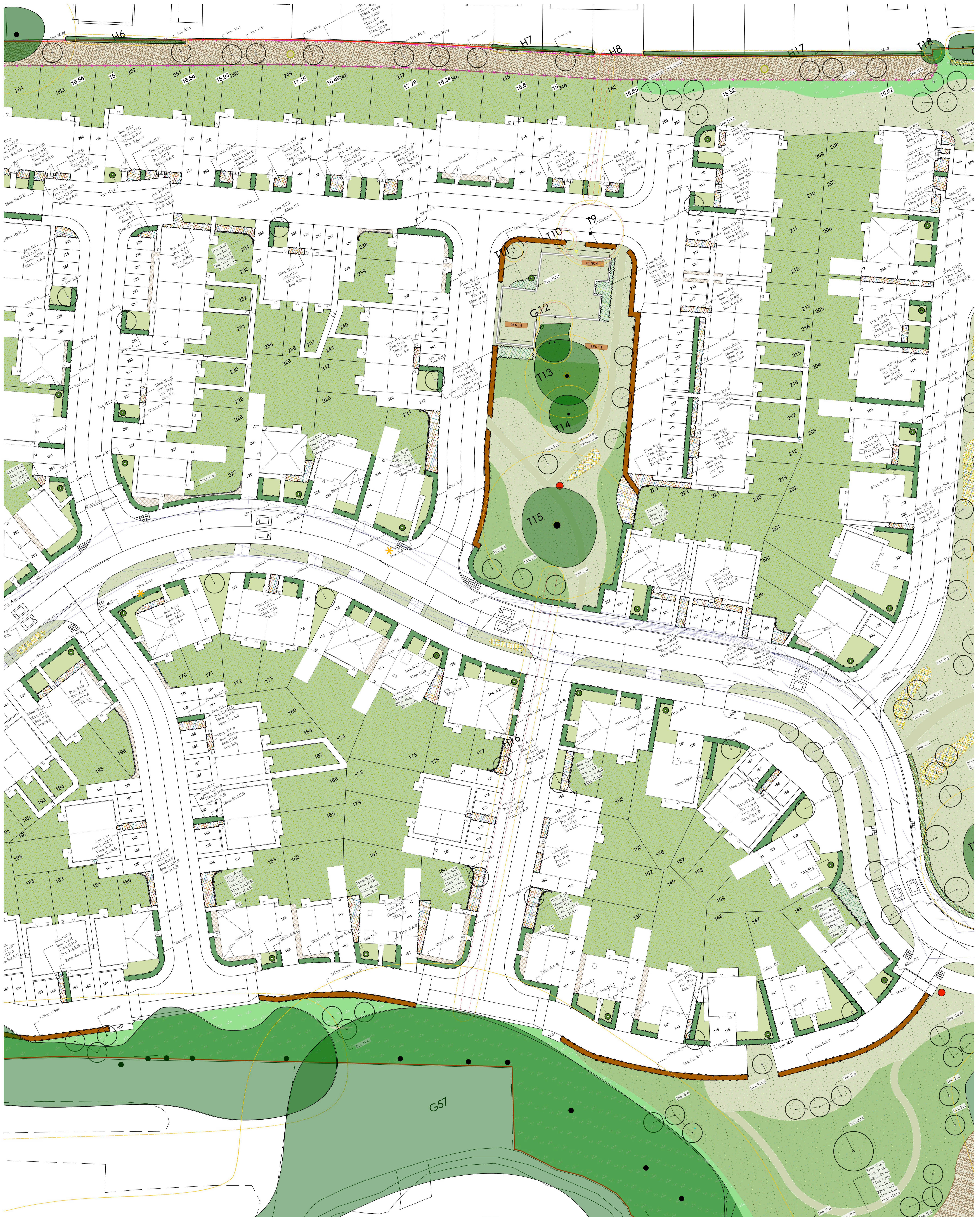
SHEET LOCATION PLAN 1:5000