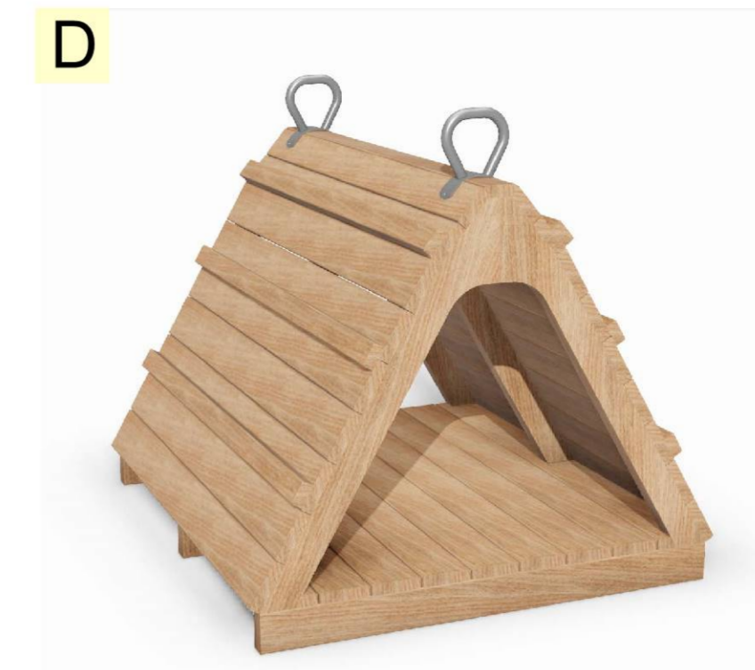
The Bull LE20490