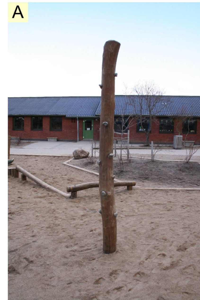
Robinia climbing post LE20526