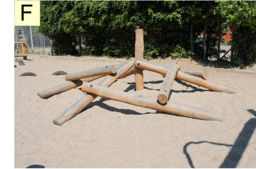
Robinia Climbing Pyramid LE20534