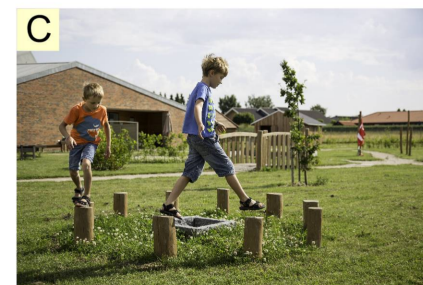
Robinia balancing posts - 10 posts LE20520