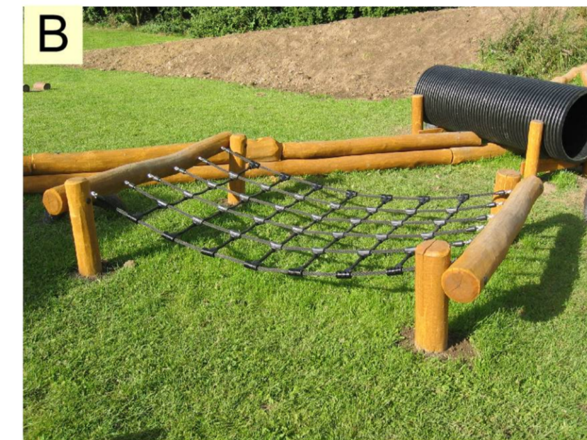
Robinia horizontal climbing net LE20904