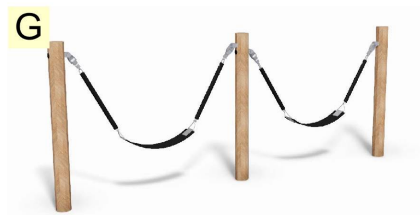
Robinia Double Swing - Belt Seats N3262U