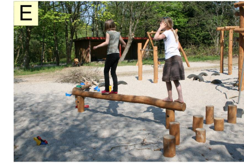
Robinia Balancing Beam - 280 cm LE20532