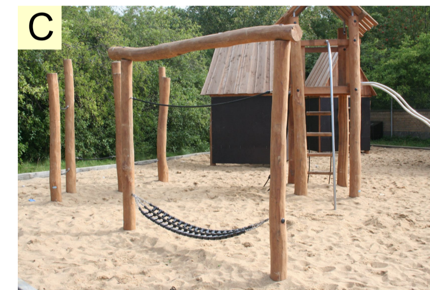
C Robinia Balancing bridge LE20960

NOTES: PlaySmart UK grass matting 'ecosmart' safer surfacing to areas where Critical Fall Height is greater than 0.6m or required to reduce wear. Amenity grass to be laid under matting.