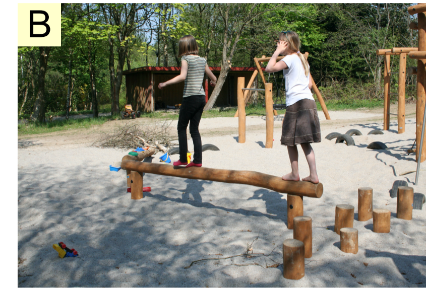
B Robinia Balancing Beam - 280 cm LE20532