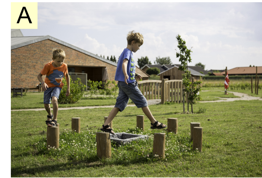
A Robinia balancing posts - 10 posts LE20520