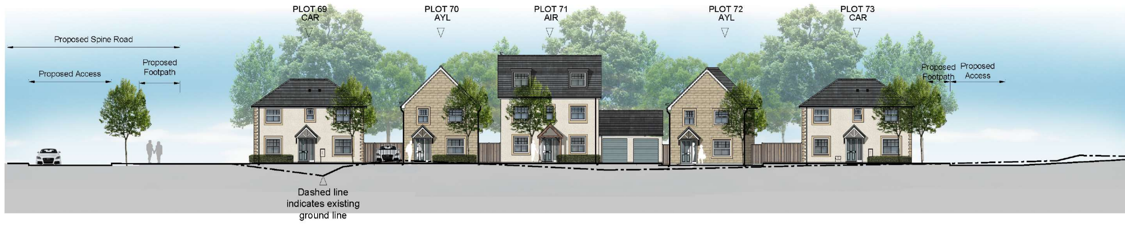
Street Scene 5-5

IMPORTANT NOTE: ALL DIMENSIONS AND LEVELS SHOWN ON THIS DRAWING ARE TO BE CHECKED BY THE CONTRACTOR/MANUFACTURER PRIOR TO THE COMMENCEMENT OF ANY WORKS ON SITE OR THE MANUFACTURE OF ANY SITE COMPONENTS. THIS DRAWING IS NOT TO BE SCALED. DIMENSIONS ARE INDICATED IN MILLIMETRES UNLESS CLEARLY STATED OTHERWISE. COPYRIGHT OF THIS DRAWING BELONGS SOLELY TO BALDWIN DESIGN CONSULTANCY LTD.