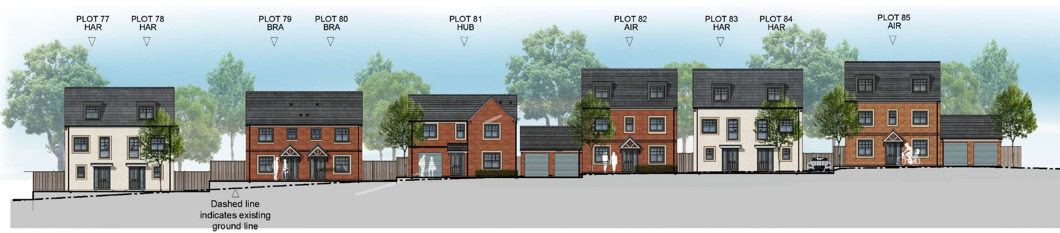
Street Scene 8-8