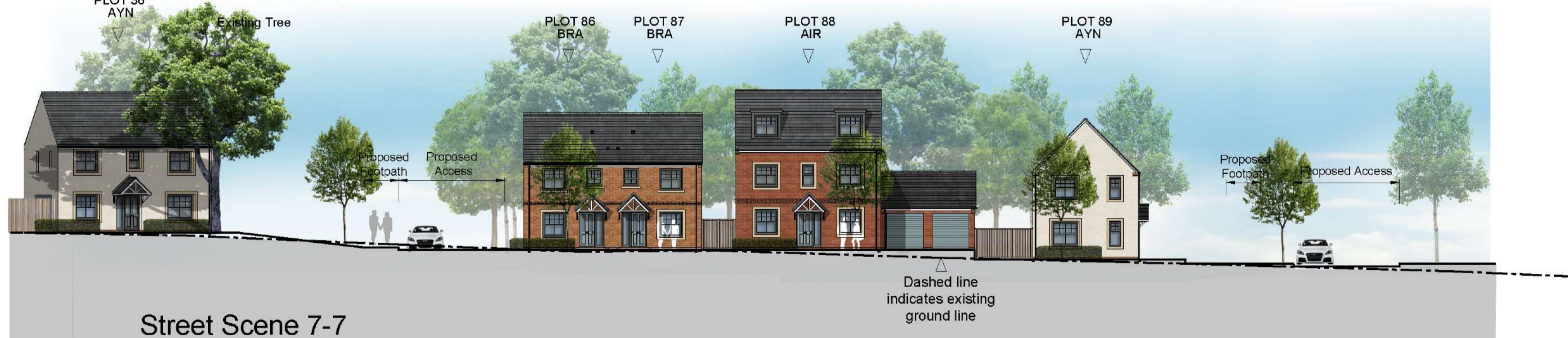
Street Scene 7-7