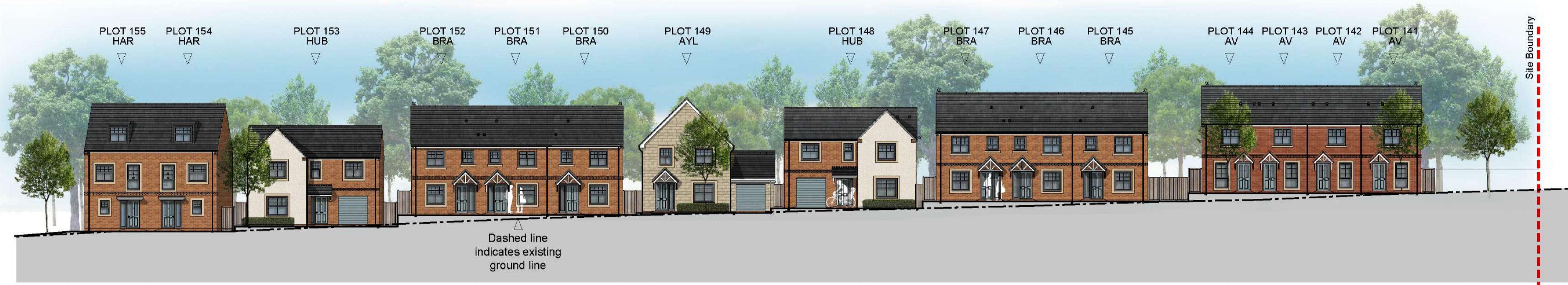
Street Scene 6-6