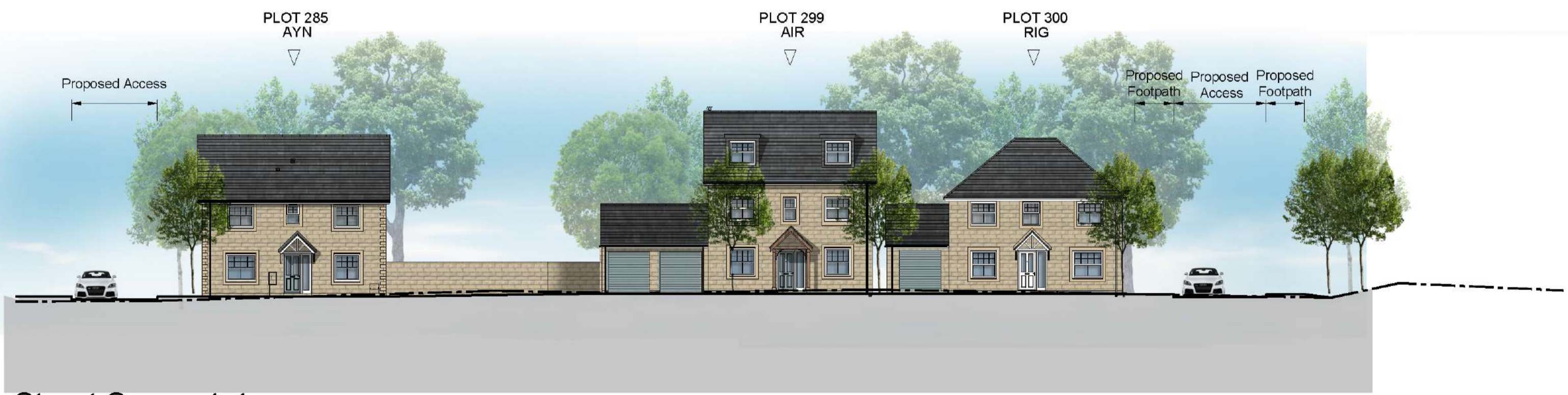
Street Scene 4-4