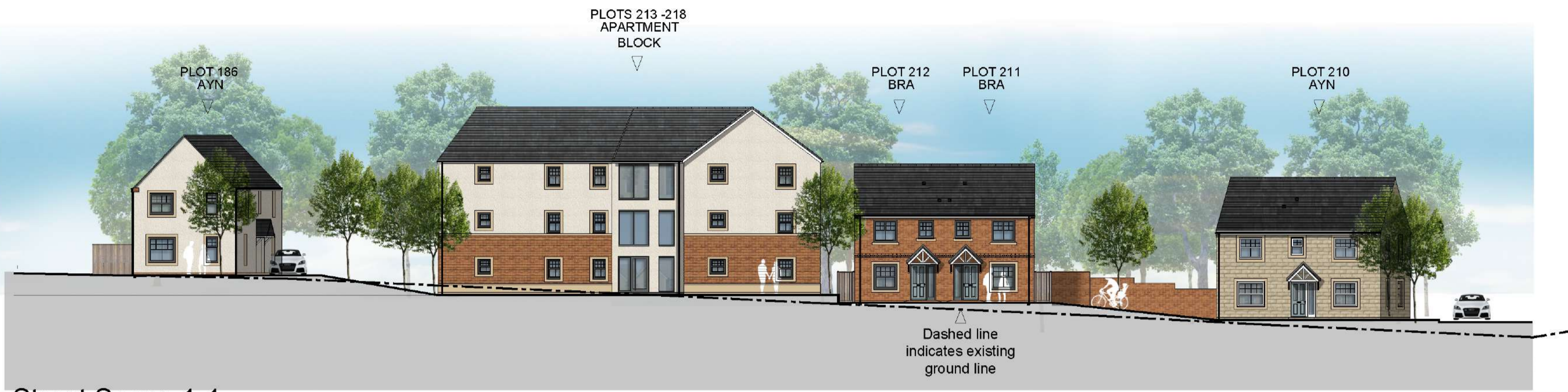
Street Scene 1-1

IMPORTANT NOTE: ALL DIMENSIONS AND LEVELS SHOWN ON THIS DRAWING ARE TO BE CHECKED BY THE CONTRACTOR/MANUFACTURER PRIOR TO THE COMMENCEMENT OF ANY WORKS ON SITE OR THE MANUFACTURE OF ANY SITE COMPONENTS. THIS DRAWING IS NOT TO BE SCALED. DIMENSIONS ARE INDICATED IN MILLIMETRES UNLESS CLEARLY STATED OTHERWISE. COPYRIGHT OF THIS DRAWING BELONGS SOLELY TO BALDWIN DESIGN CONSULTANCY LTD.