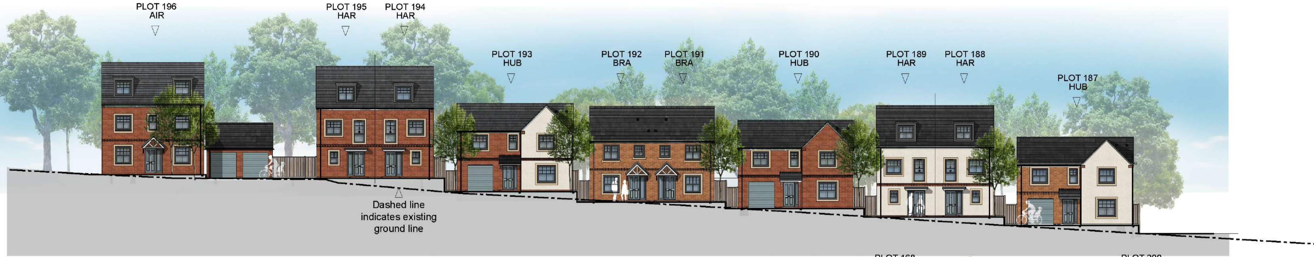
Street Scene 2-2