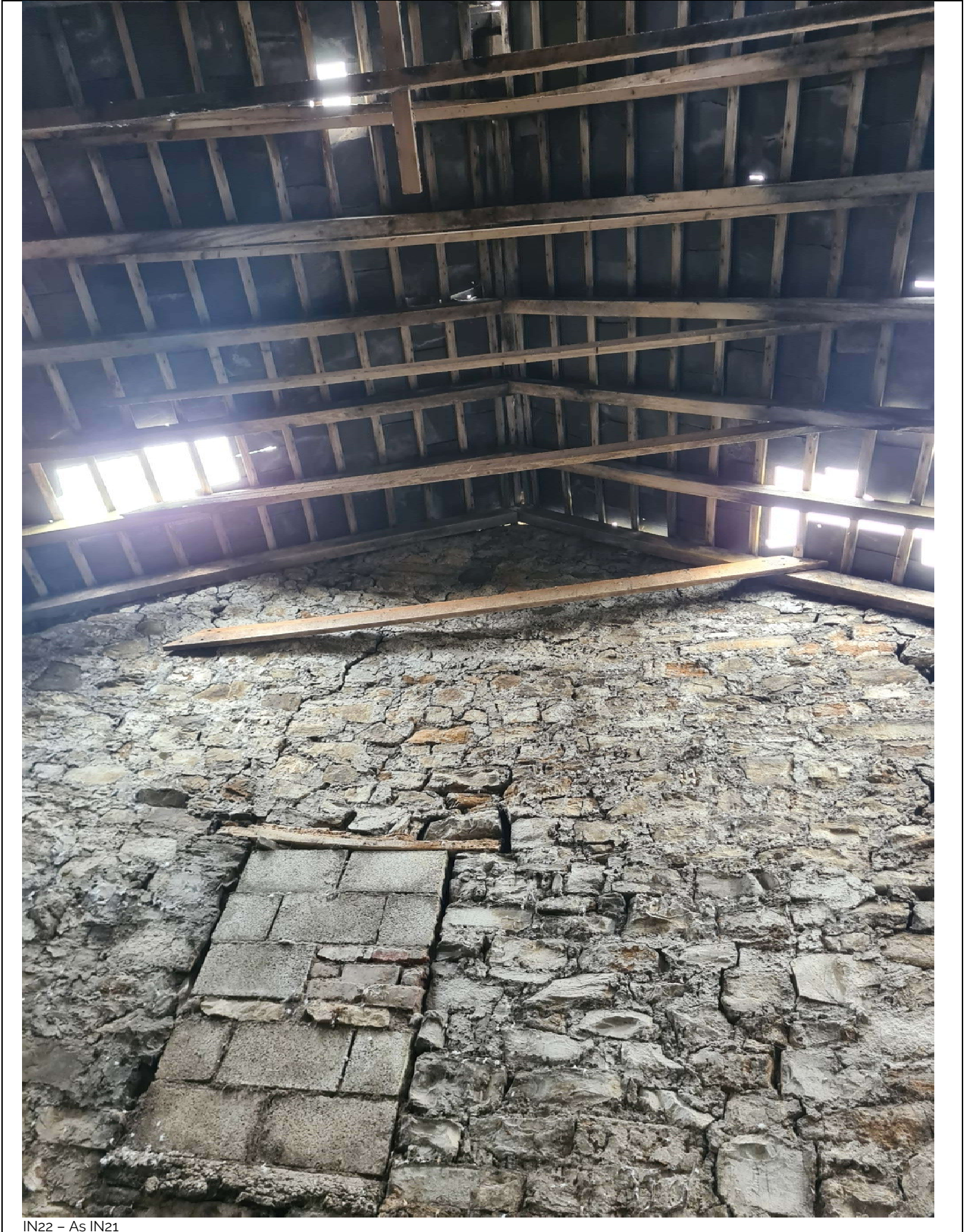
IN22 - As IN21