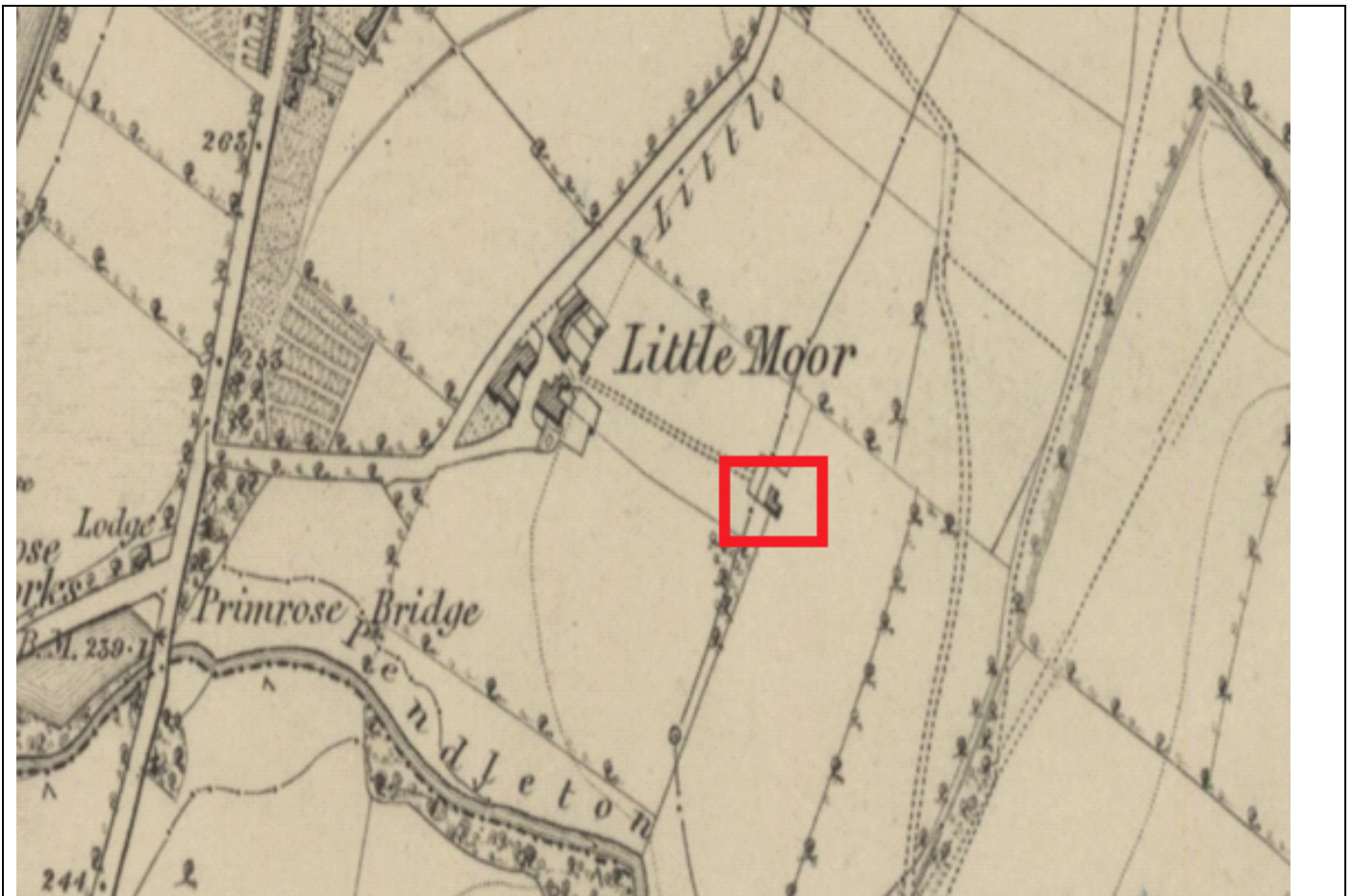
Historical Map, Ordnance Survey 1844