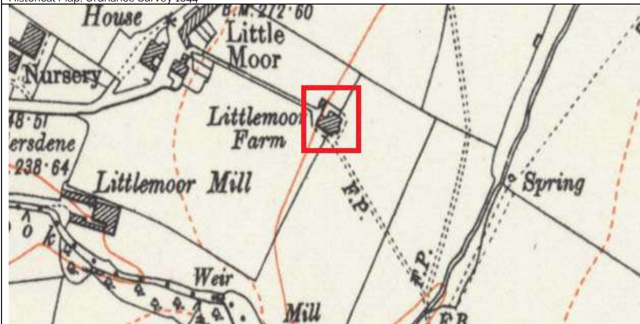
Historical Map, Ordnance Survey 1934 - No Change Noted