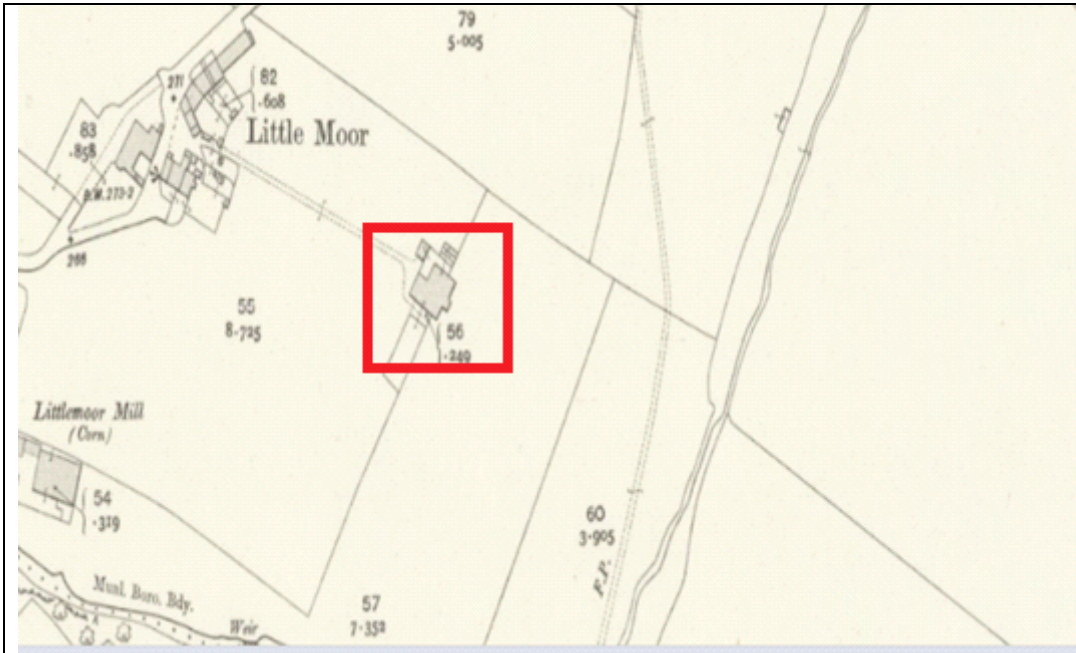
Historical Map, Ordnance Survey 1912 - No Change Noted