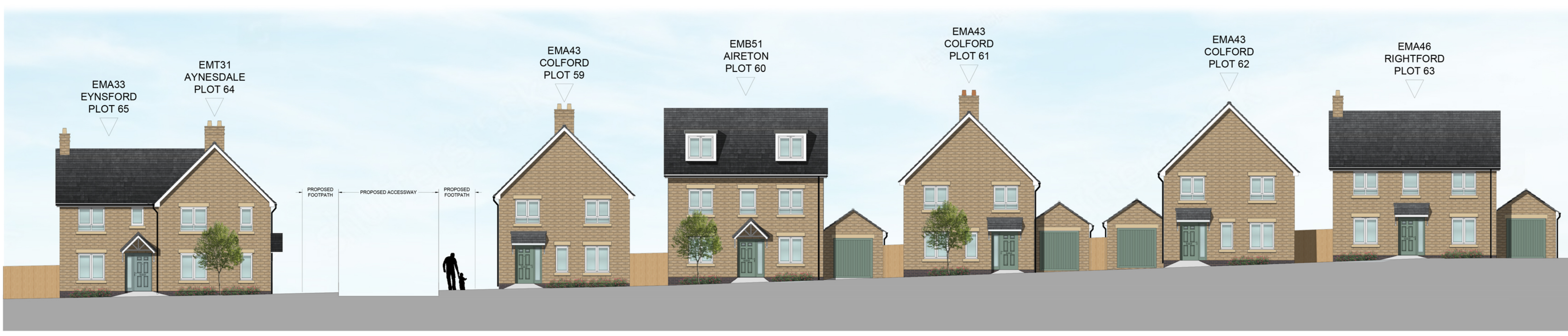
Street Scene 3-3

103 102 101 100 99 98 97 96 95 94 93 92 91