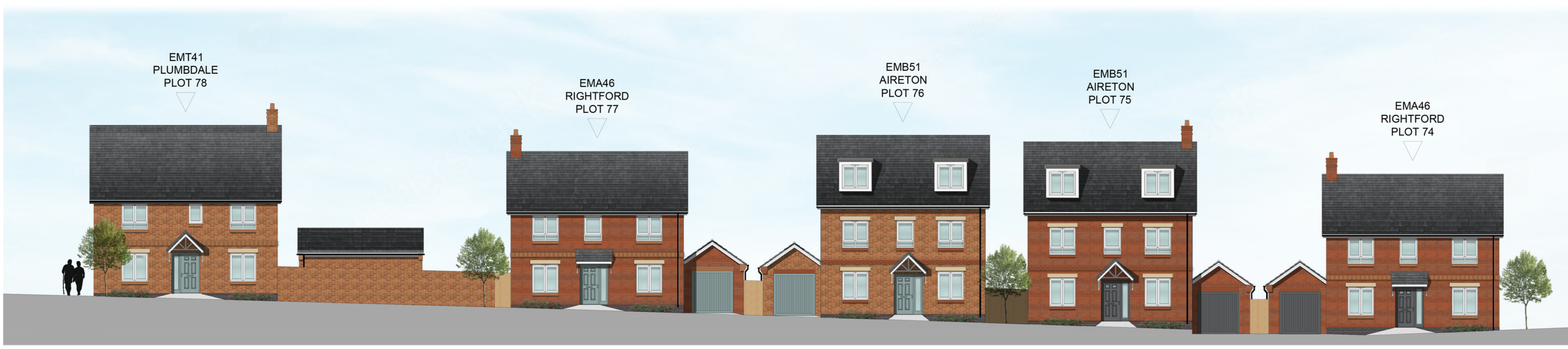
Street Scene 2-2

108 107 106 105 104 103 102 101 100 99 98 97 96