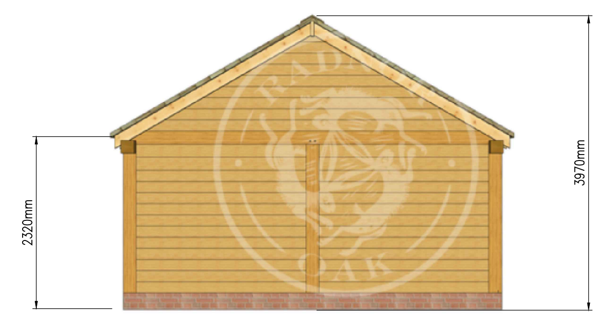
Proposed Plans & Elevations (1:50)