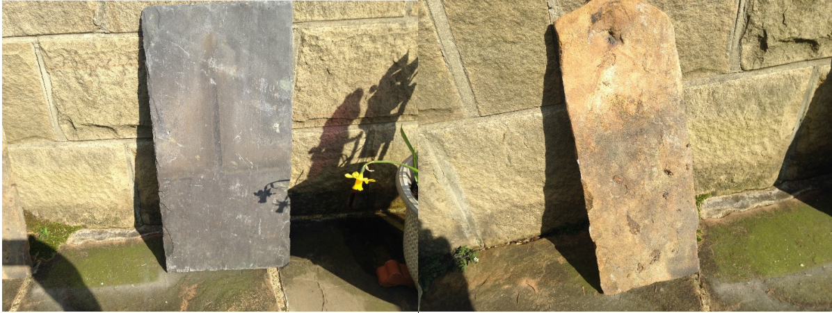
Metamorphic slate roof tiles (Welsh slate)

Materials to match the existing have been sourced, and are pictured below.