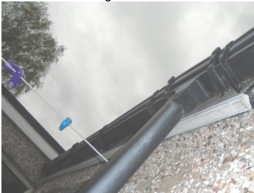
Rear roof pitch