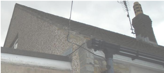
Gable Verge and front fascia

The tiles are in good condition and very tight fitting, the pointing to the verges and ridge tiles is in excellent condition. The fascias are flush fixed to the walls and the flashings are all tight fitting. The roof structure including the felt flat roof does not provide any possible access points, cracks or crevices with the potential to provide roost habitat for bats.