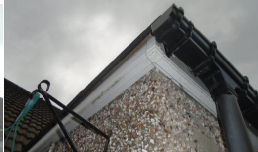
Flat roof fascia