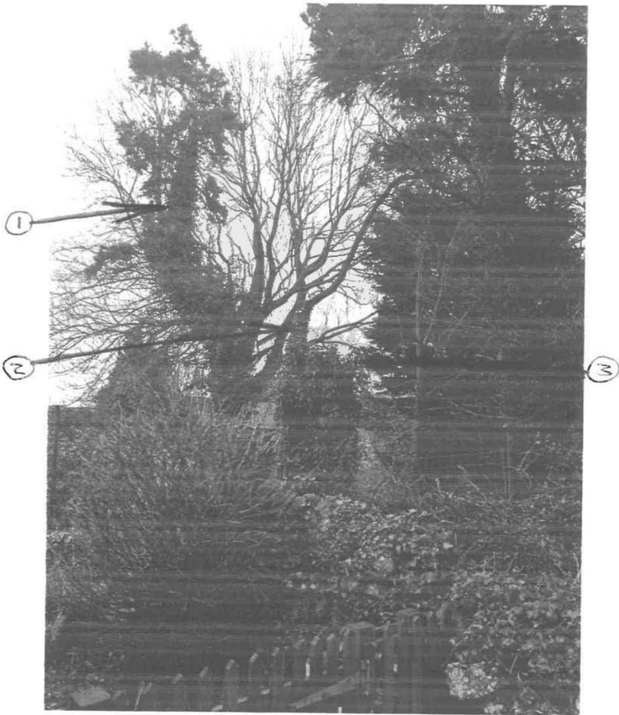
Pine trees to rear of Dock Hillock, Pendleton.