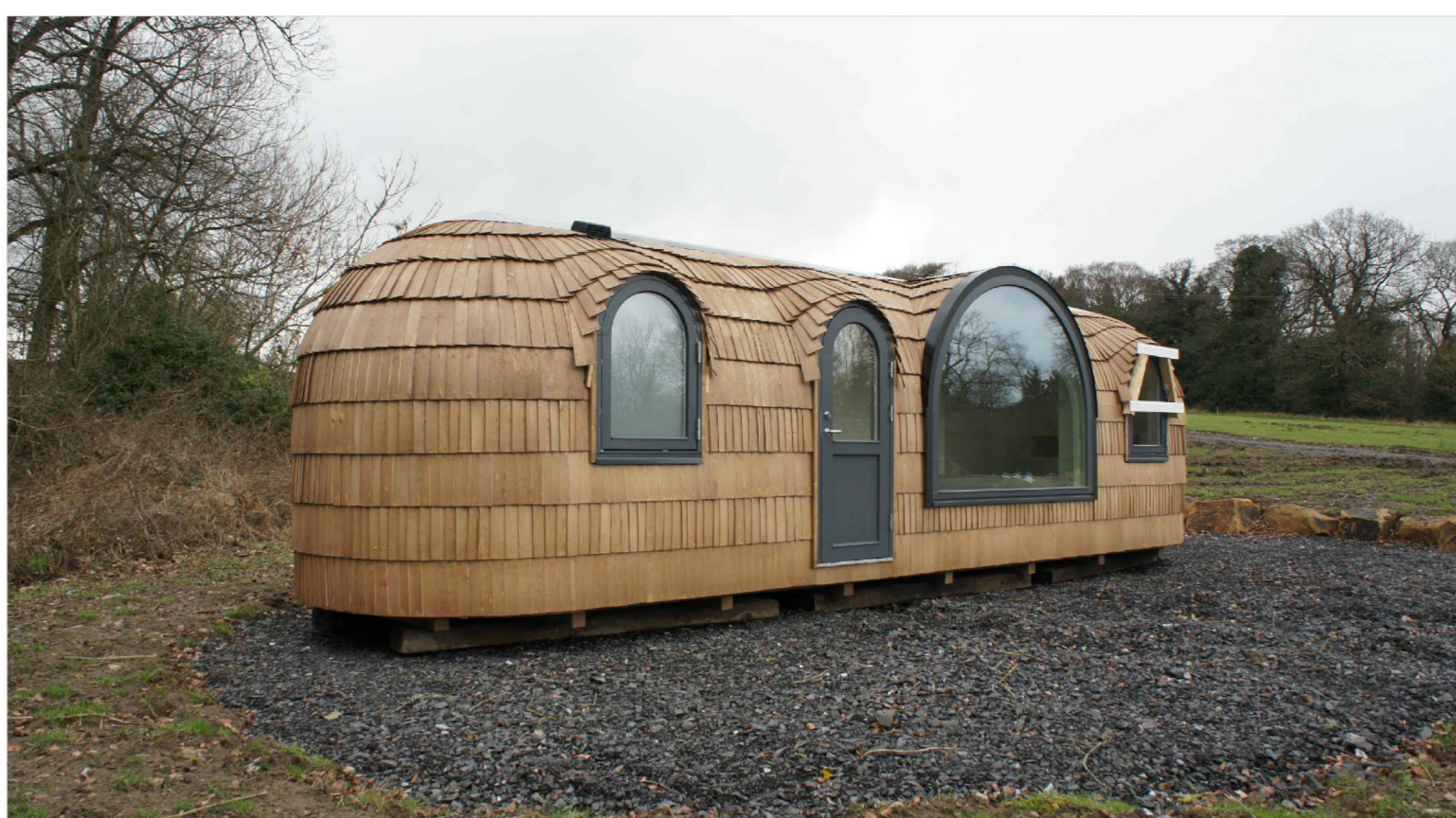
Figure 1: Eco Lodges