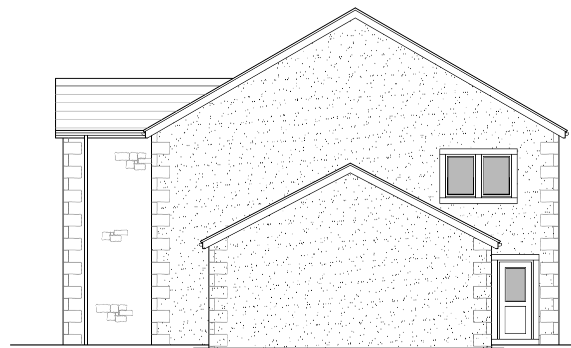
Side North East Elevation