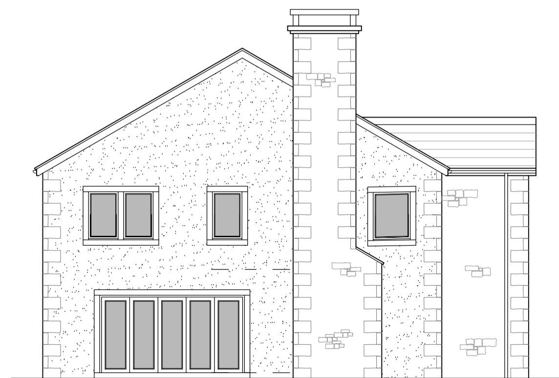
Side South West Elevation