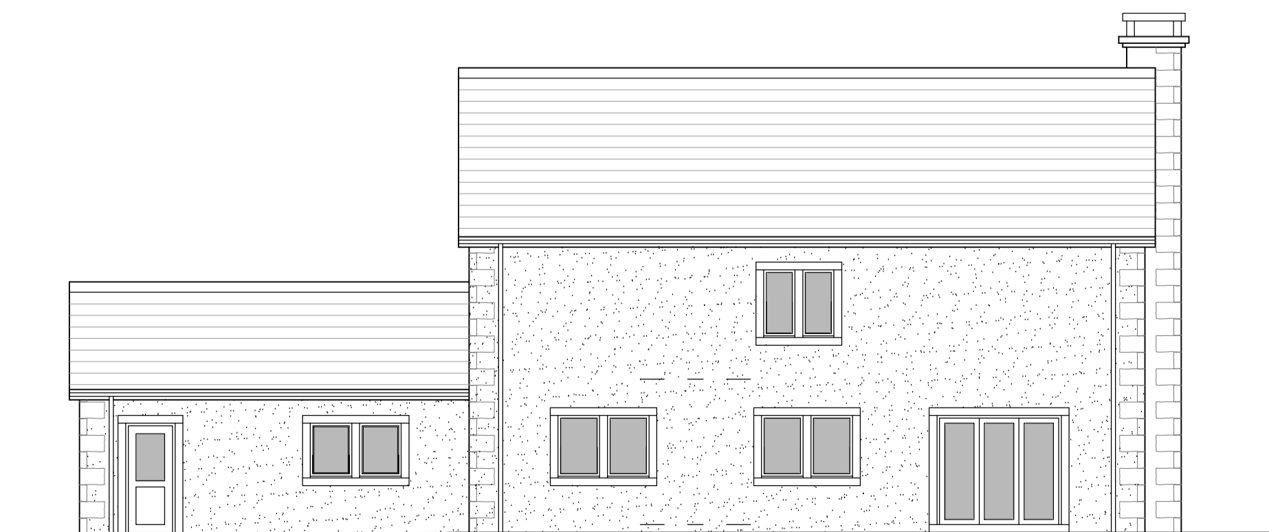
Rear North West Elevation