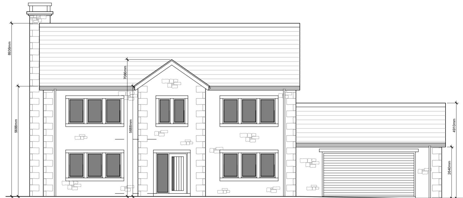
Front South East Elevation