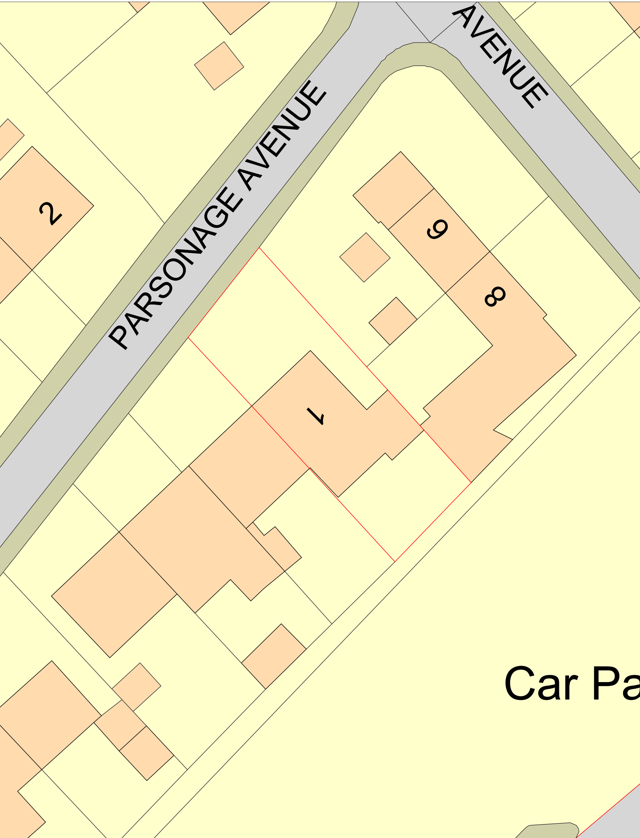
Existing Site Plan