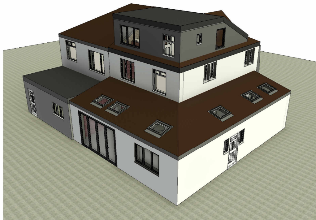
3 3D View 3