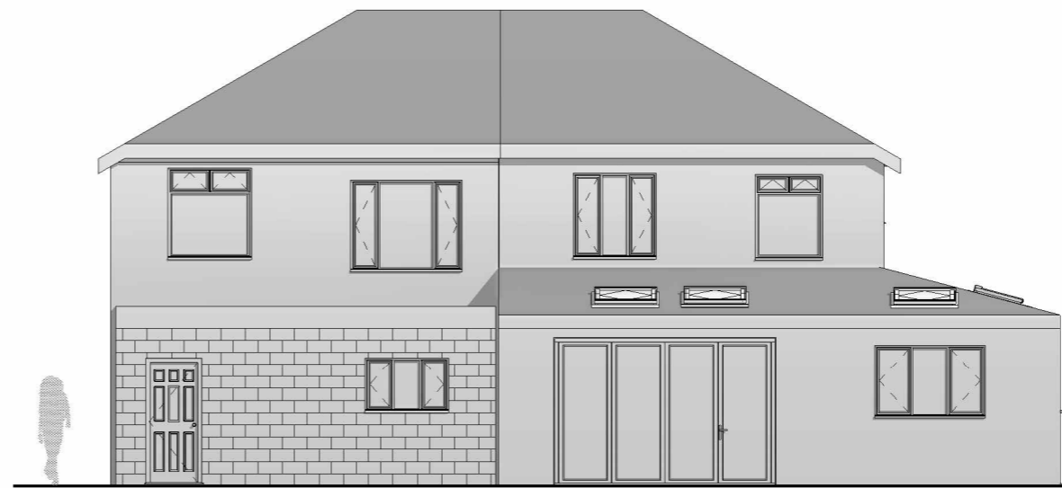
5 EXISTING REAR ELEVATION 1 : 50