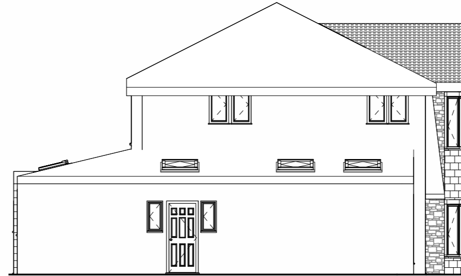
3 EXISTING SIDE ELEVATION 1 : 50