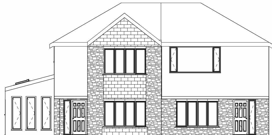
4 EXISTING FRONT ELEVATION 1 : 50