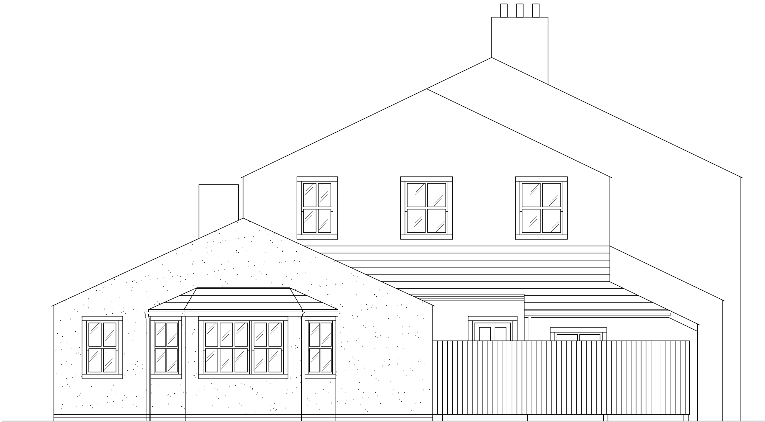
Existing end elevation