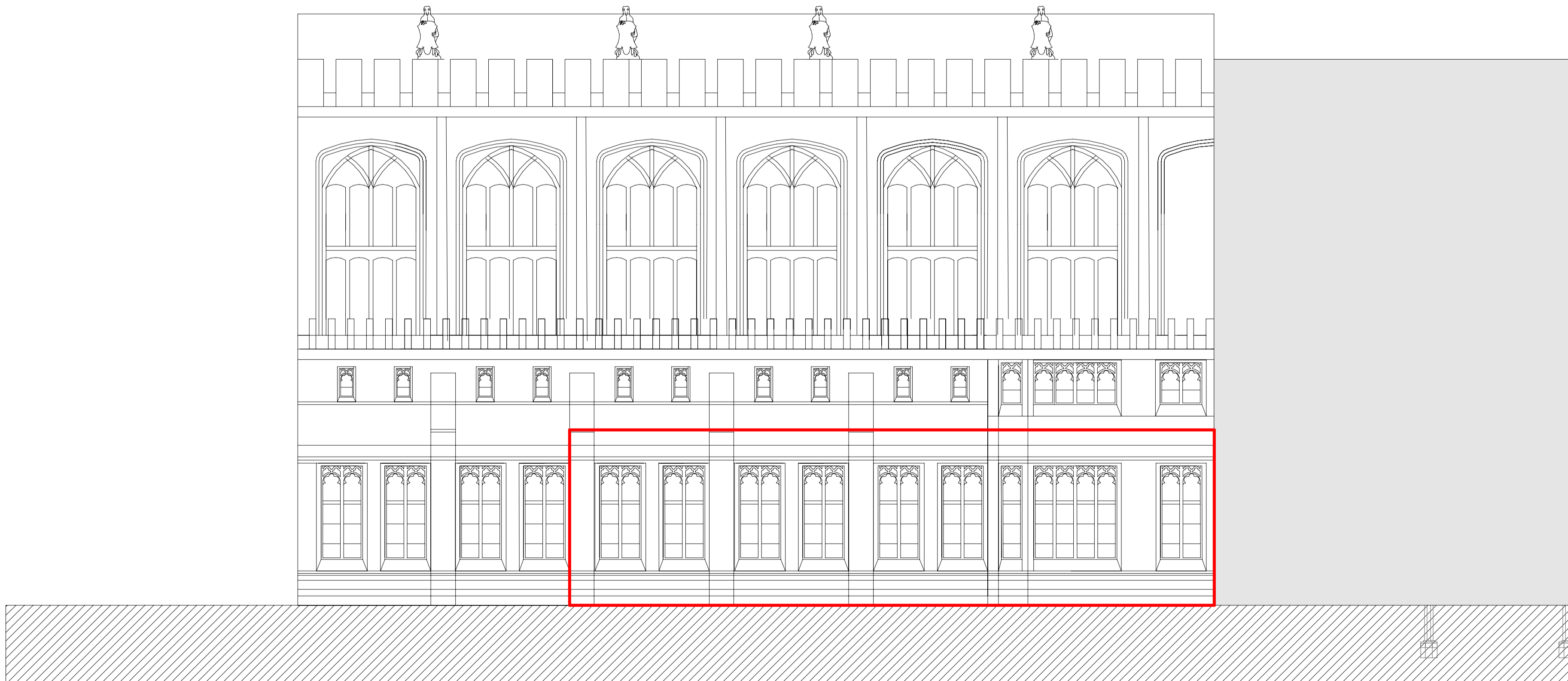
4 | Proposed West Elevation 1 : 100