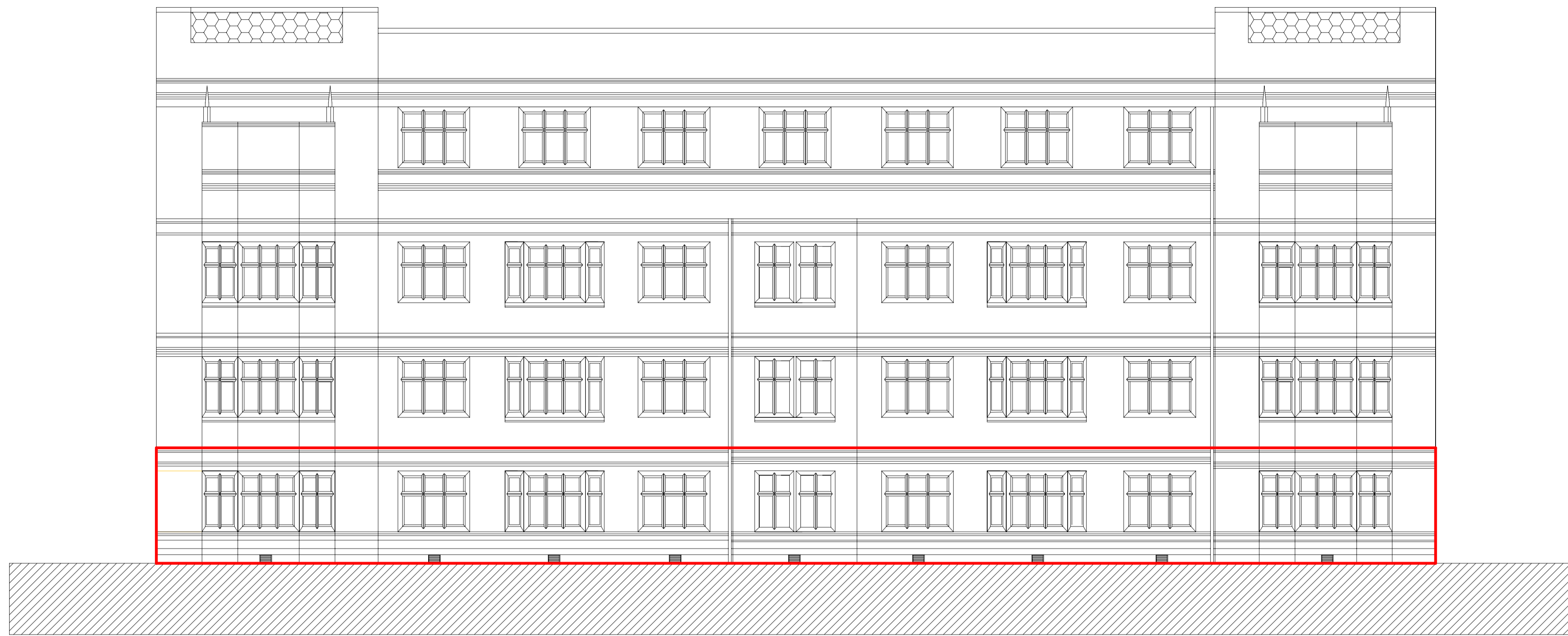
2 | Proposed South Elevation