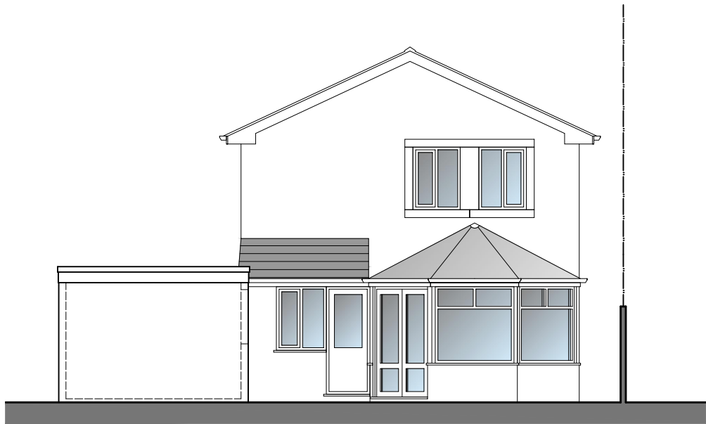
Rear (South-West) Elevation

REAR EXTENSION - 15 LITTLE LANE - LONGRIDGE - PRESTON - PR3 3NS