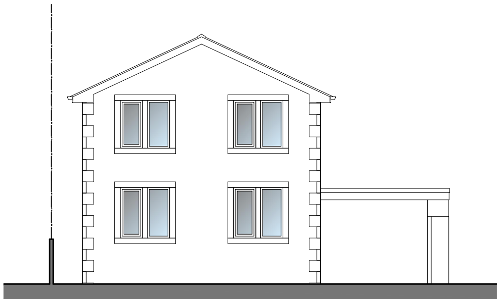
Front (North-East) Elevation