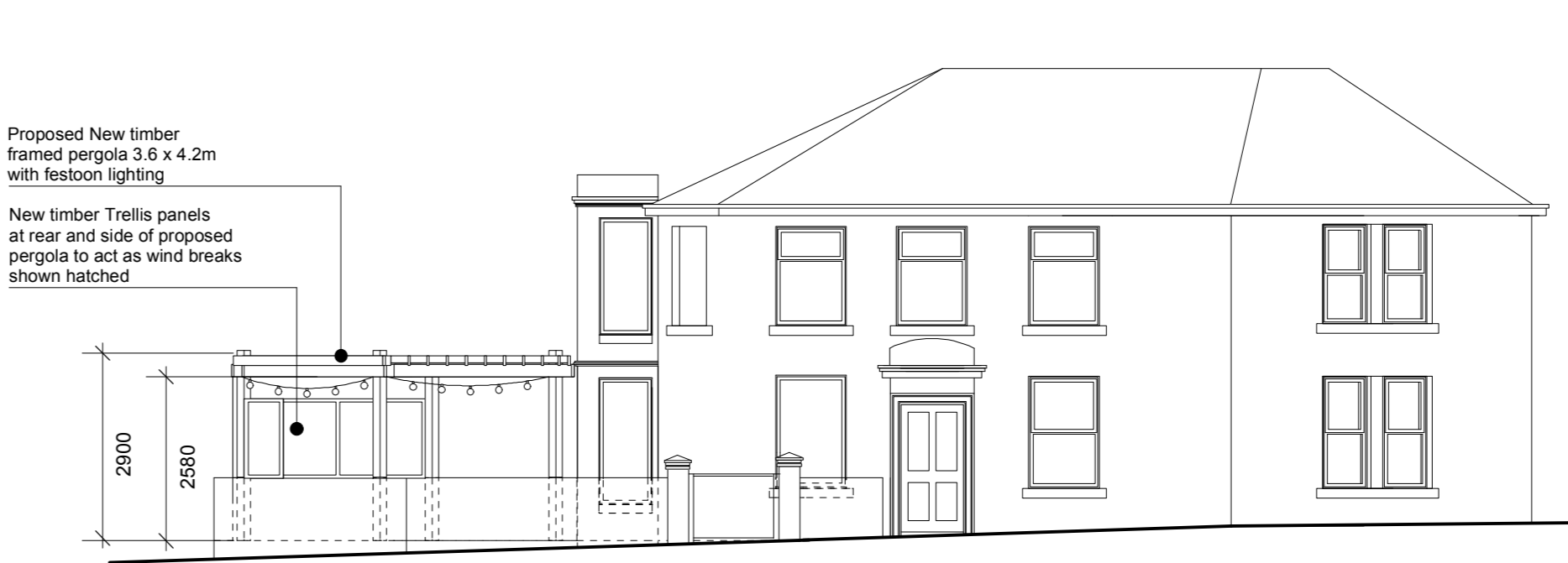
PROPOSED FRONT ELEVATION FROM WHALLEY ROAD Scale 1:100