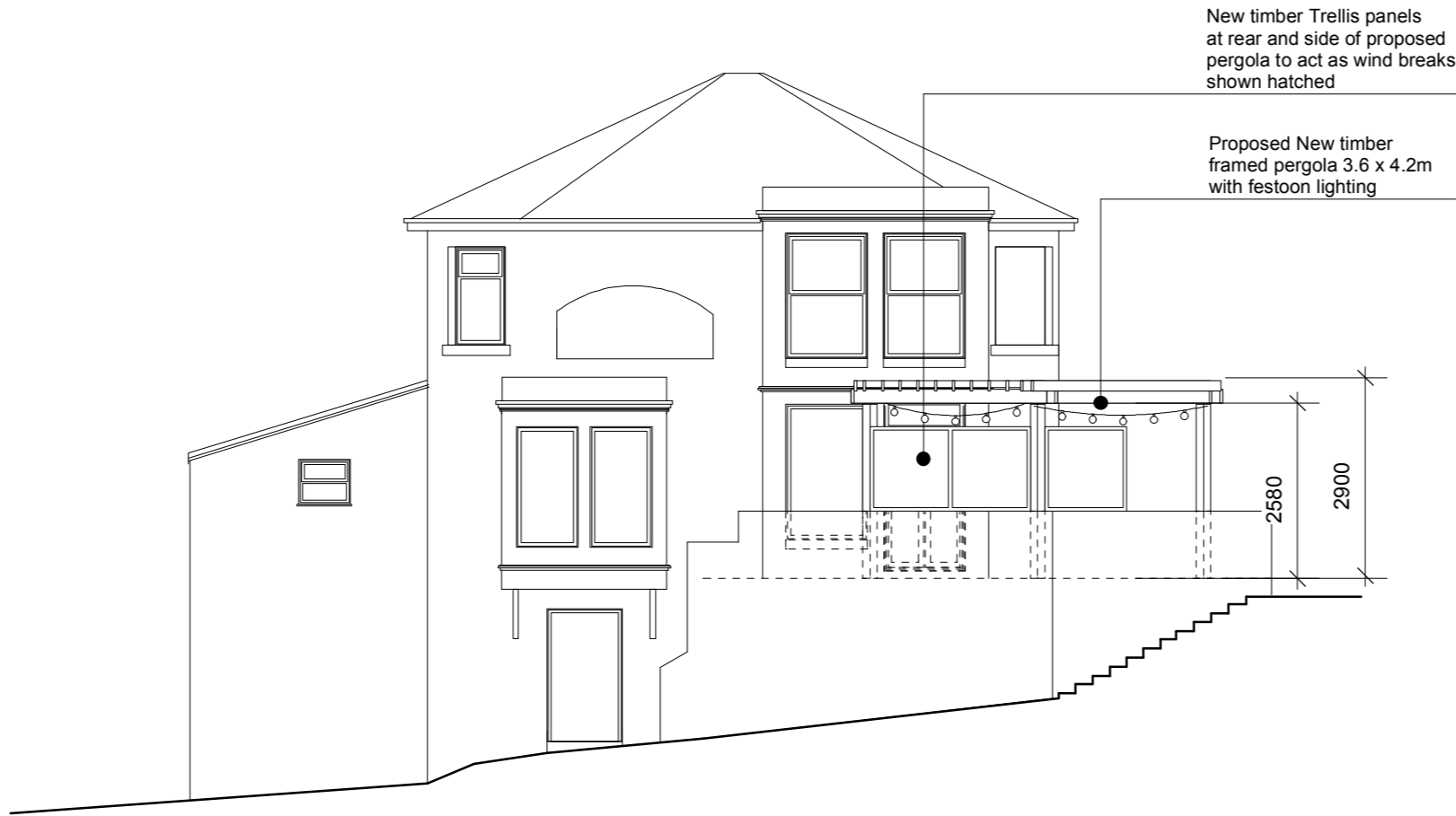
PROPOSED FRONT ELEVATION FROM JUNCTION OF RIBCHESTER ROAD & WHALLEY ROAD Scale 1:100