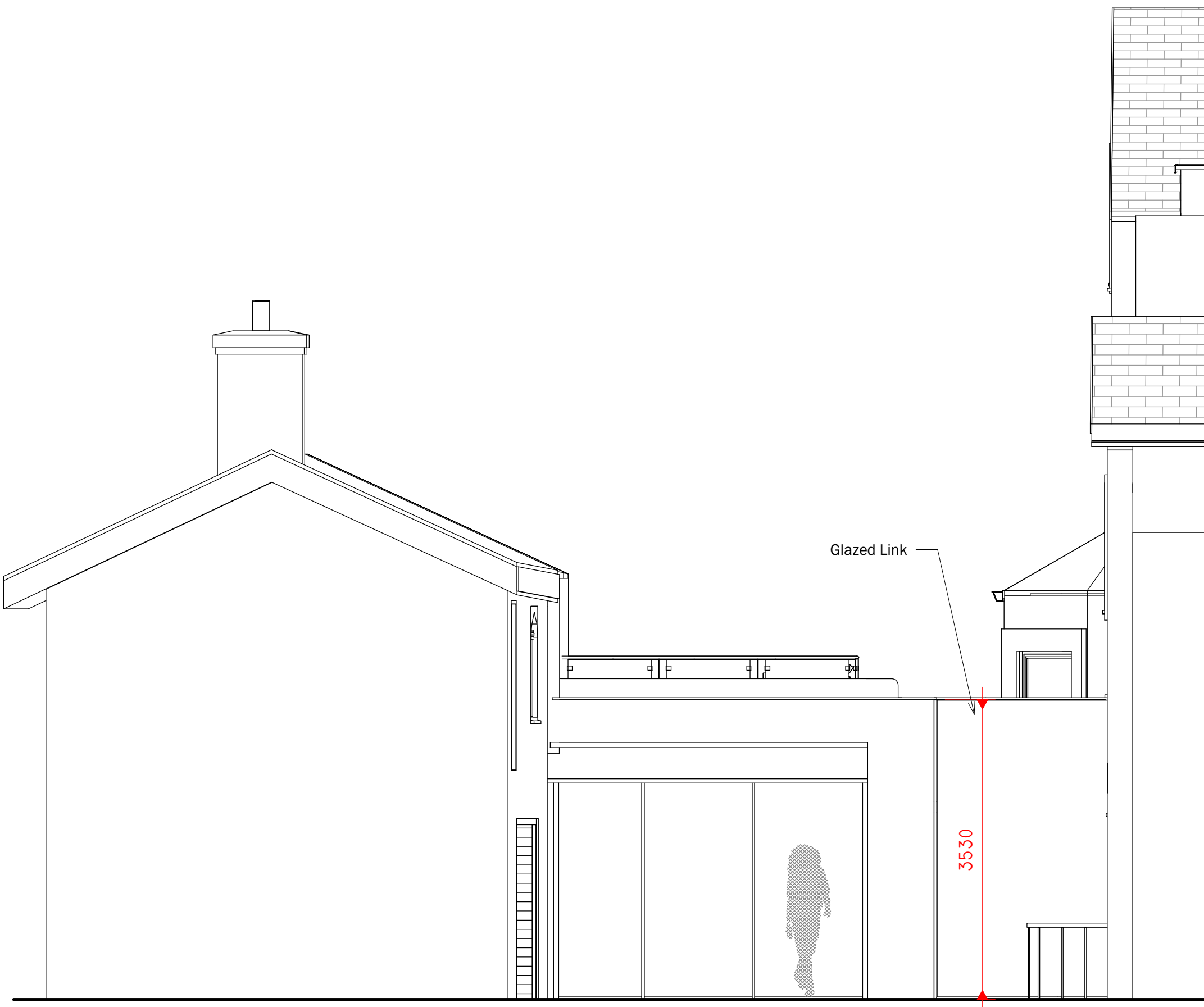
2 Proposed South 1 : 50