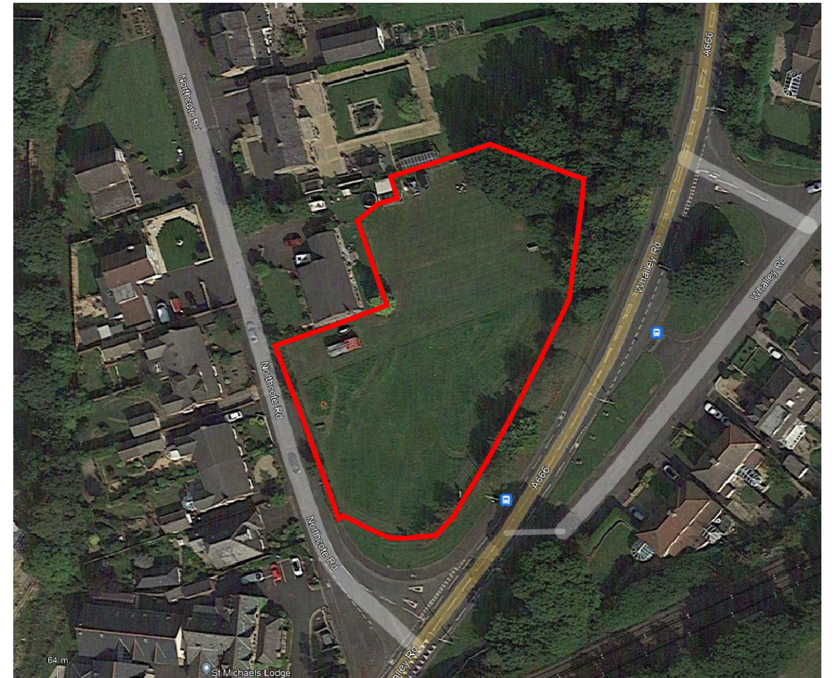
AERIAL PLAN 1:1250