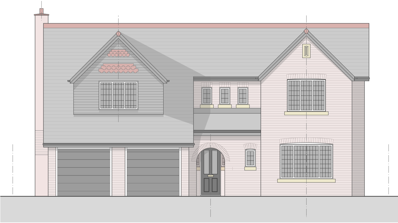
PRINCIPAL ELEVATION, EAST