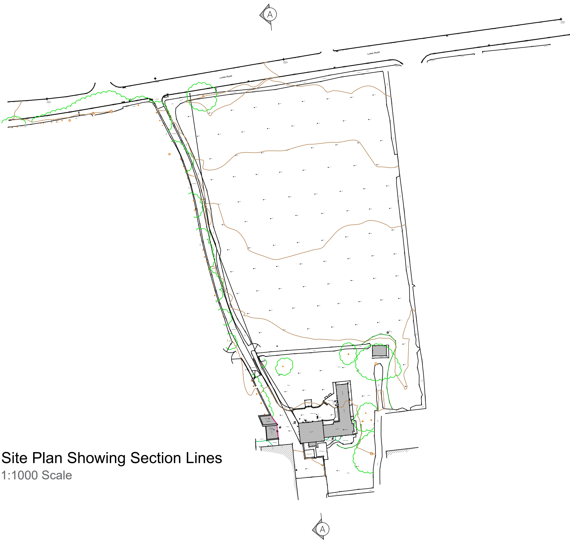
Site Plan Showing Section Lines 1:1000 Scale