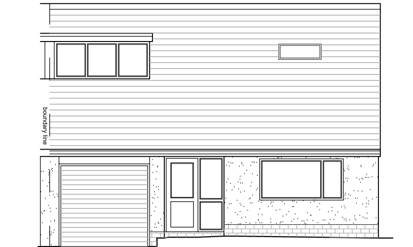
Front North West Elevation 1:100