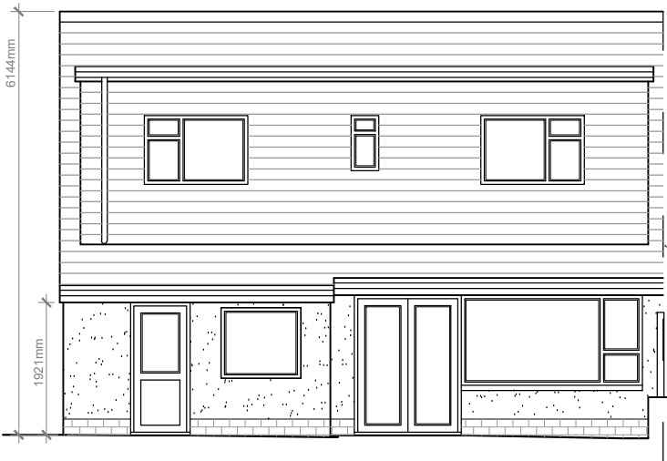
Rear South East Elevation 1:100