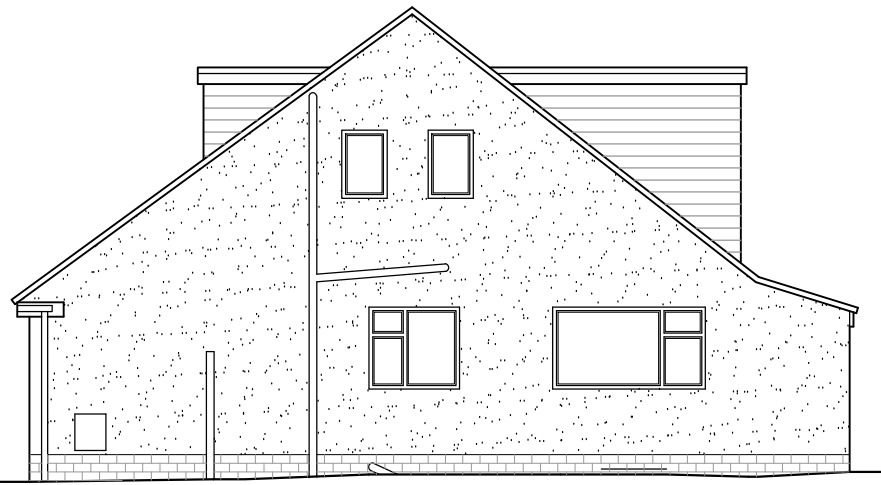
Side South West Elevation 1:100