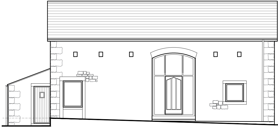
EXISTING WEST ELEVATION SCALE 1:100