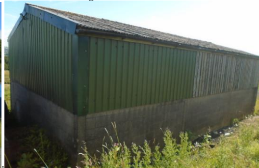
East and north elevation