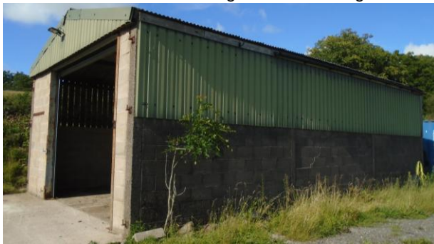
West and south elevation

The structure is a detached Agricultural building on an area of hardstanding.