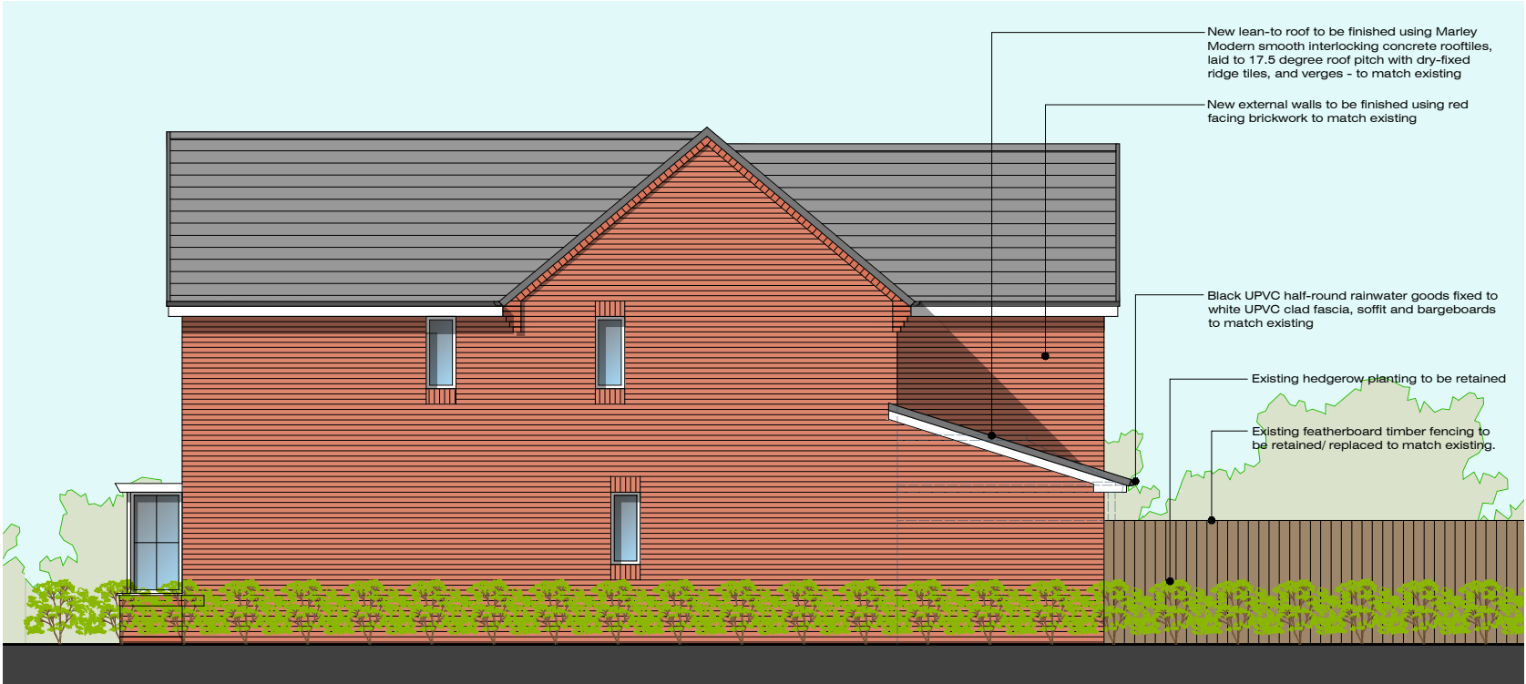
Side (West) Elevation