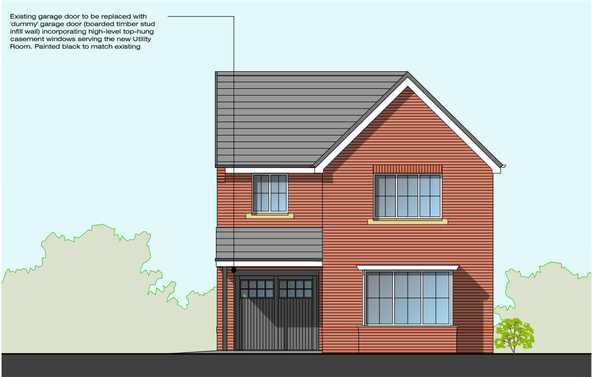
Front (North) Elevation