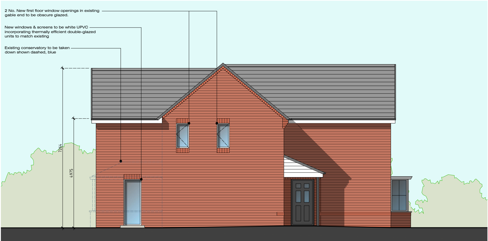
Side (East) Elevation