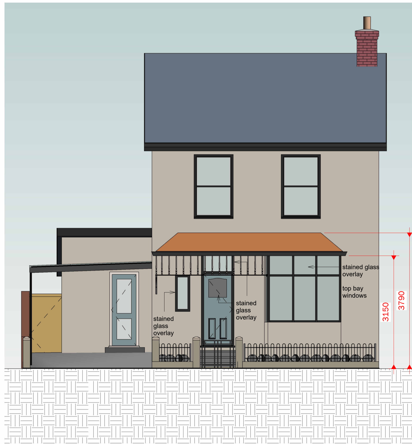
1 PROPOSED NORTH. 1 : 50