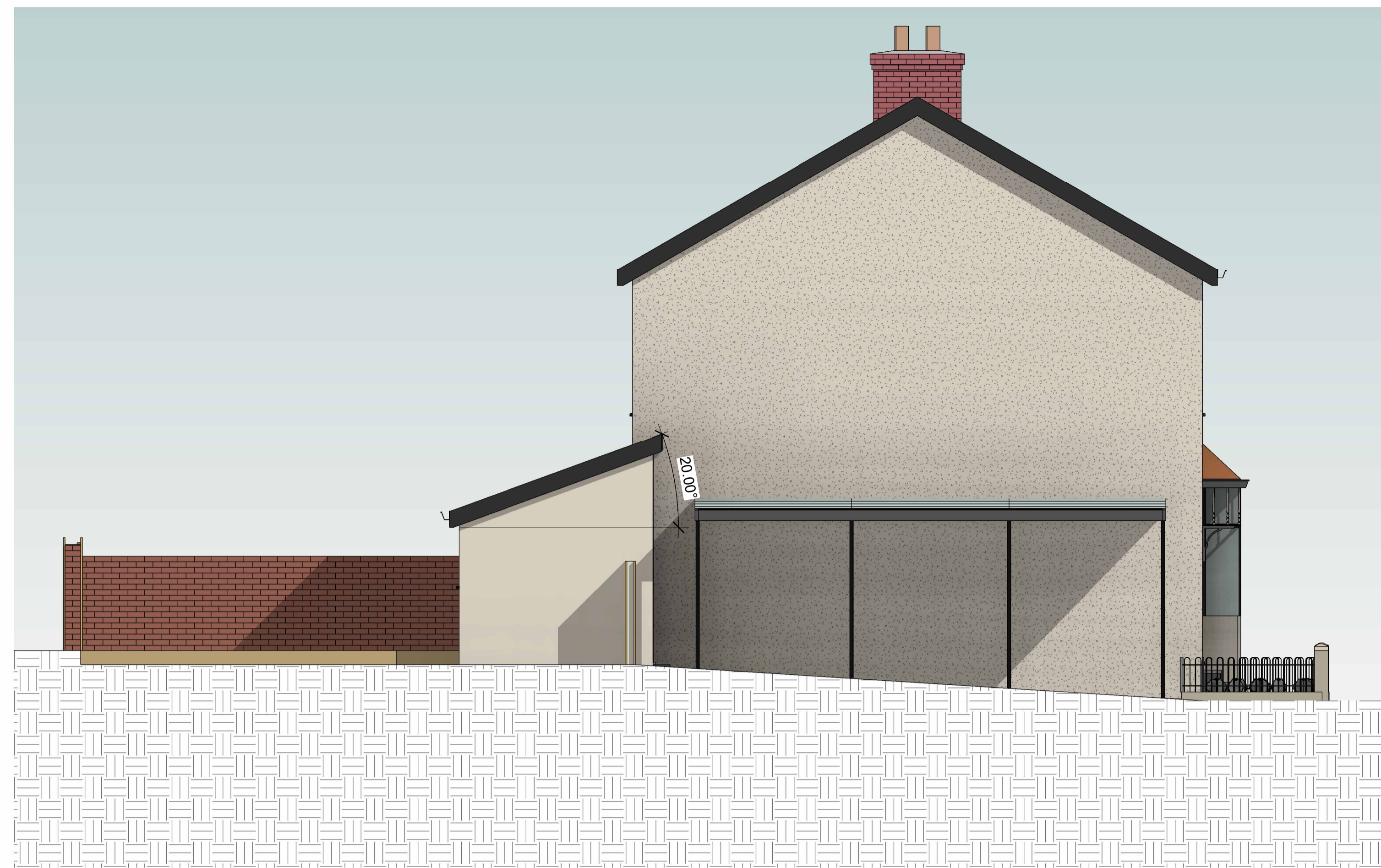
2 PROPOSED EAST 1 : 50