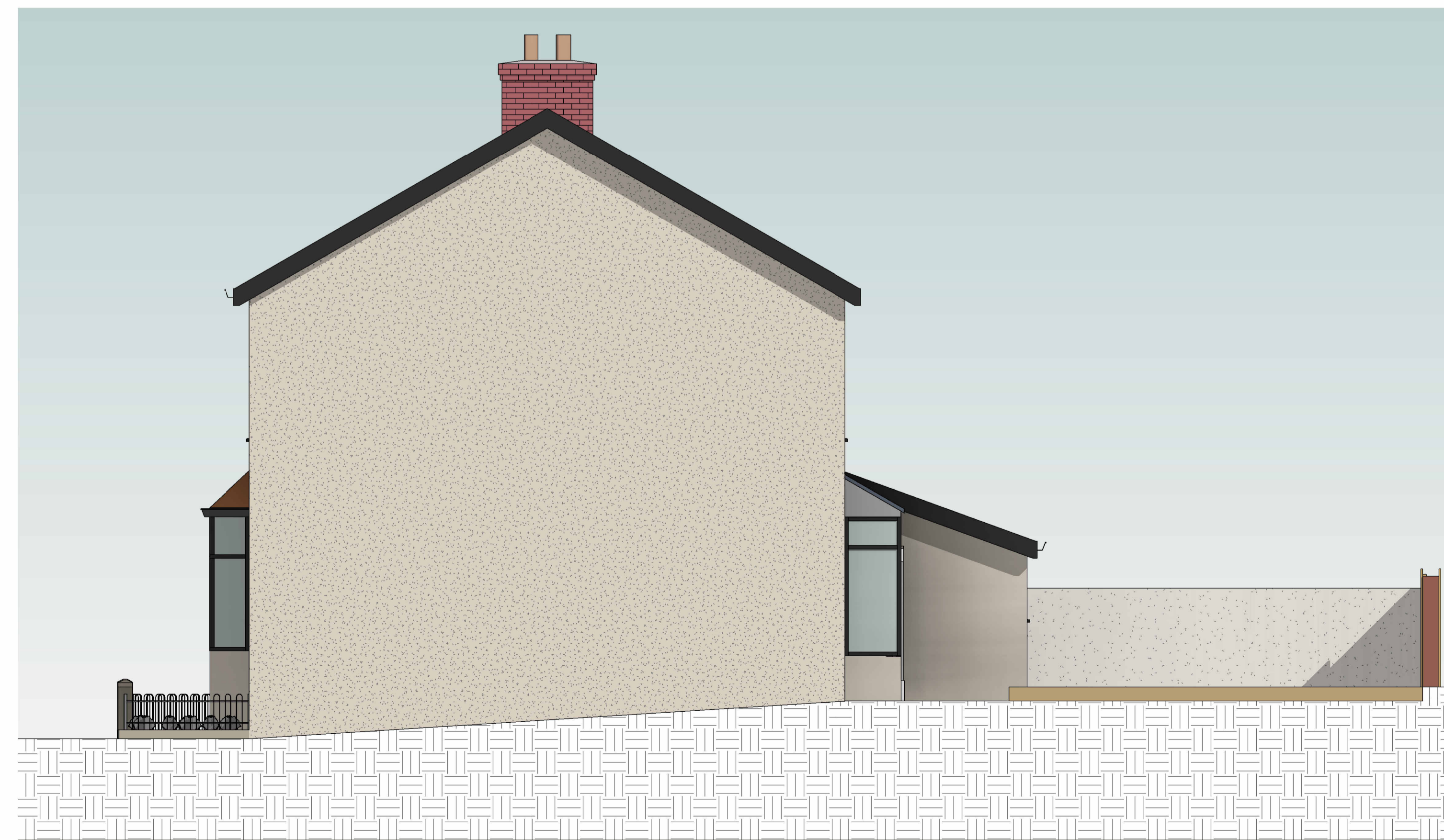
4 PROPOSED WEST 1 : 50