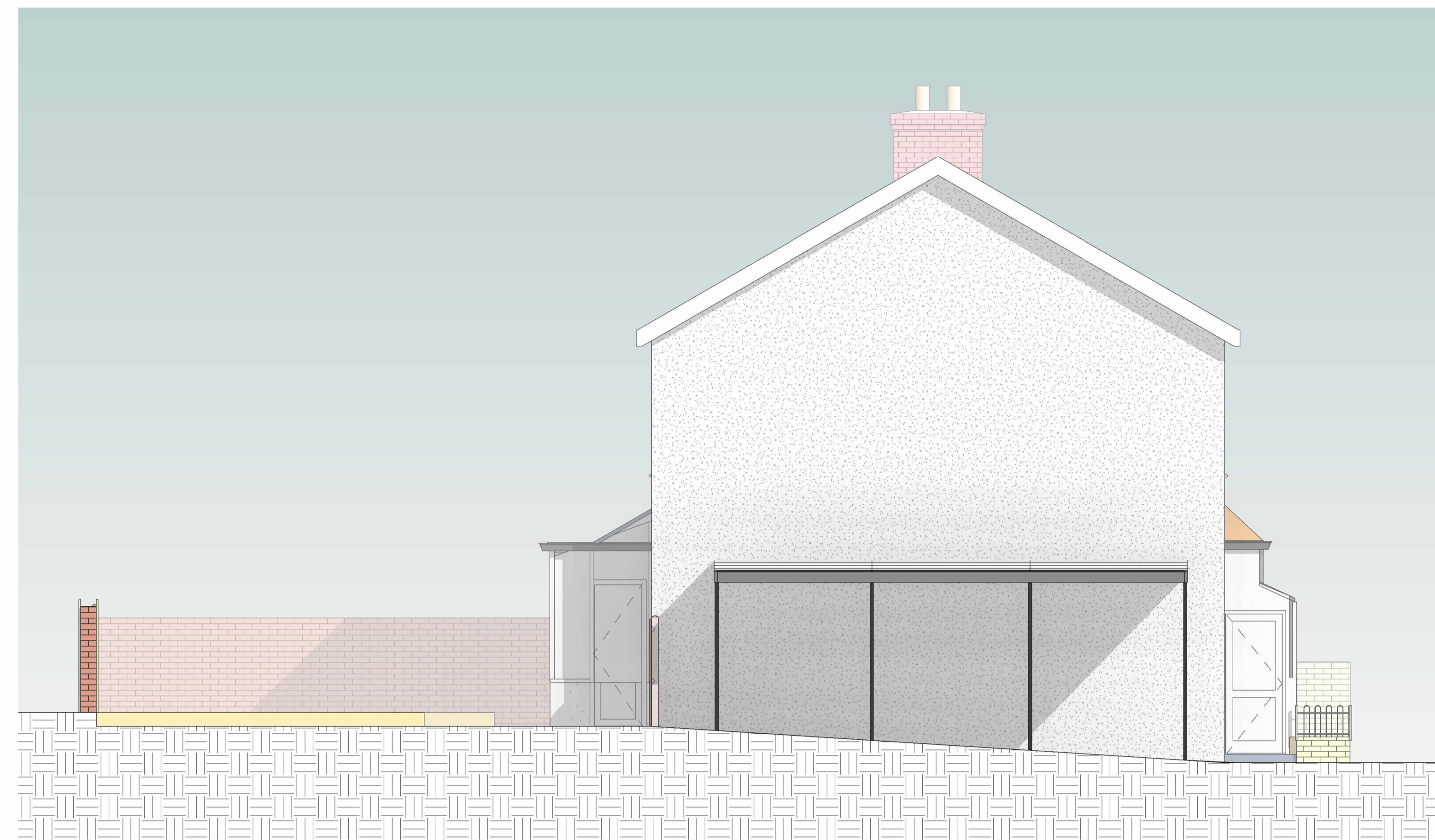
4 EXISTING EAST 1 : 50