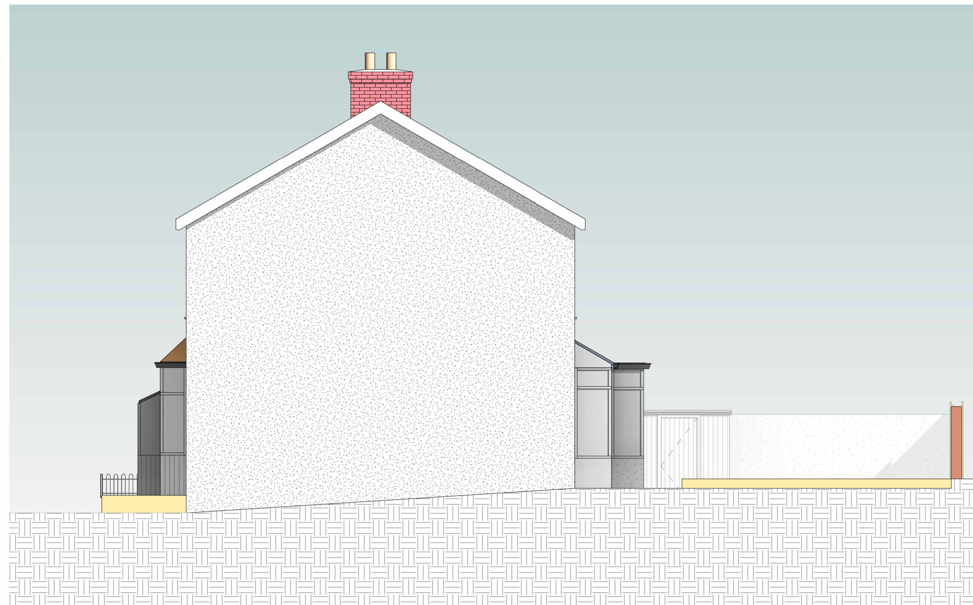
2 EXISTING WEST 1 : 50