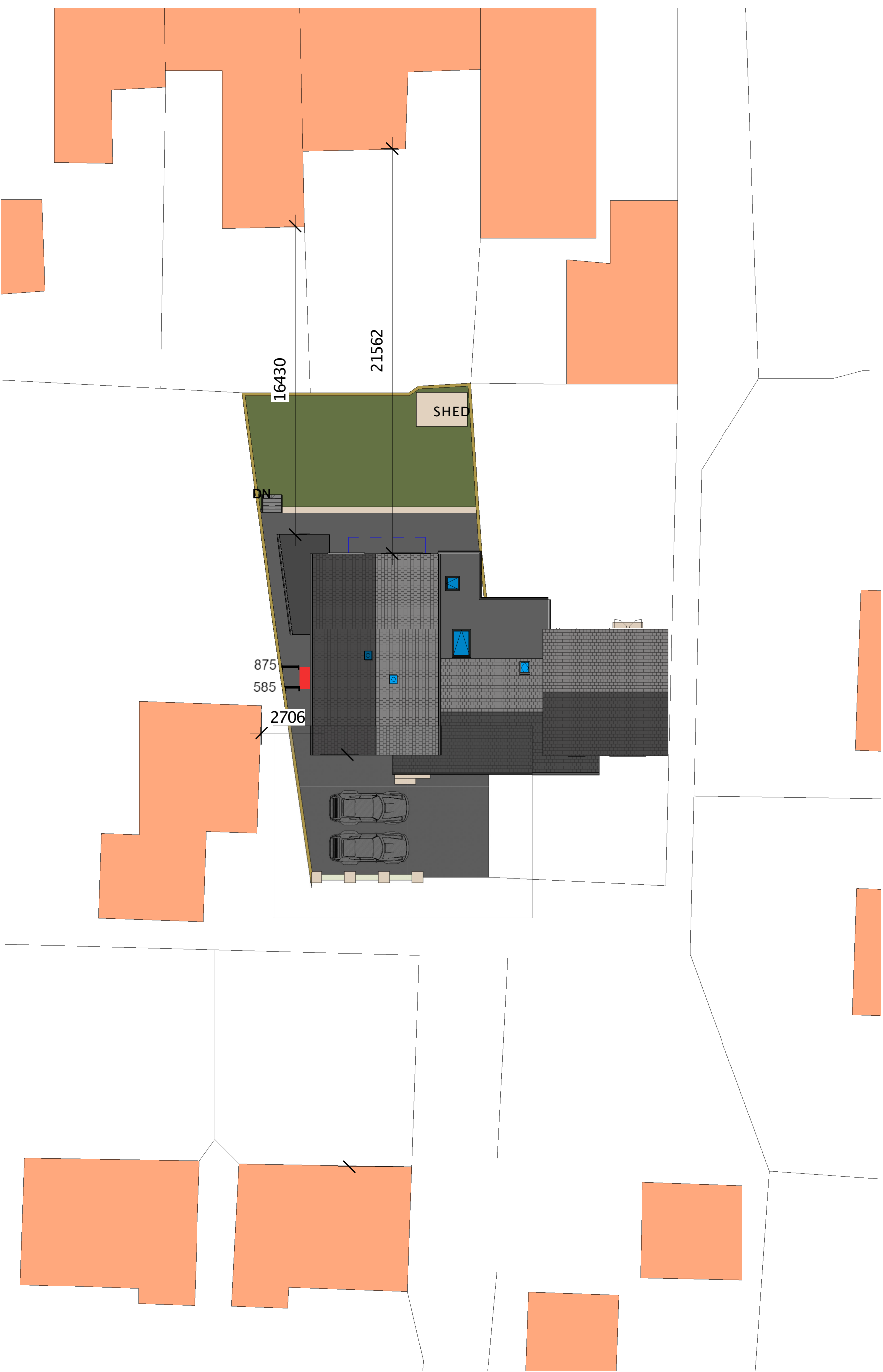
AS BUILT SITE PLAN 1:200