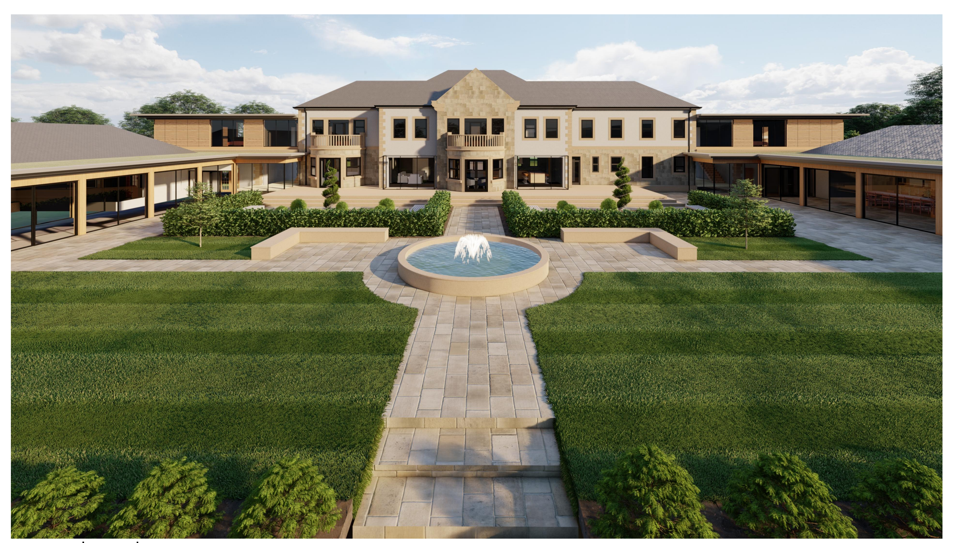
proposed rear view