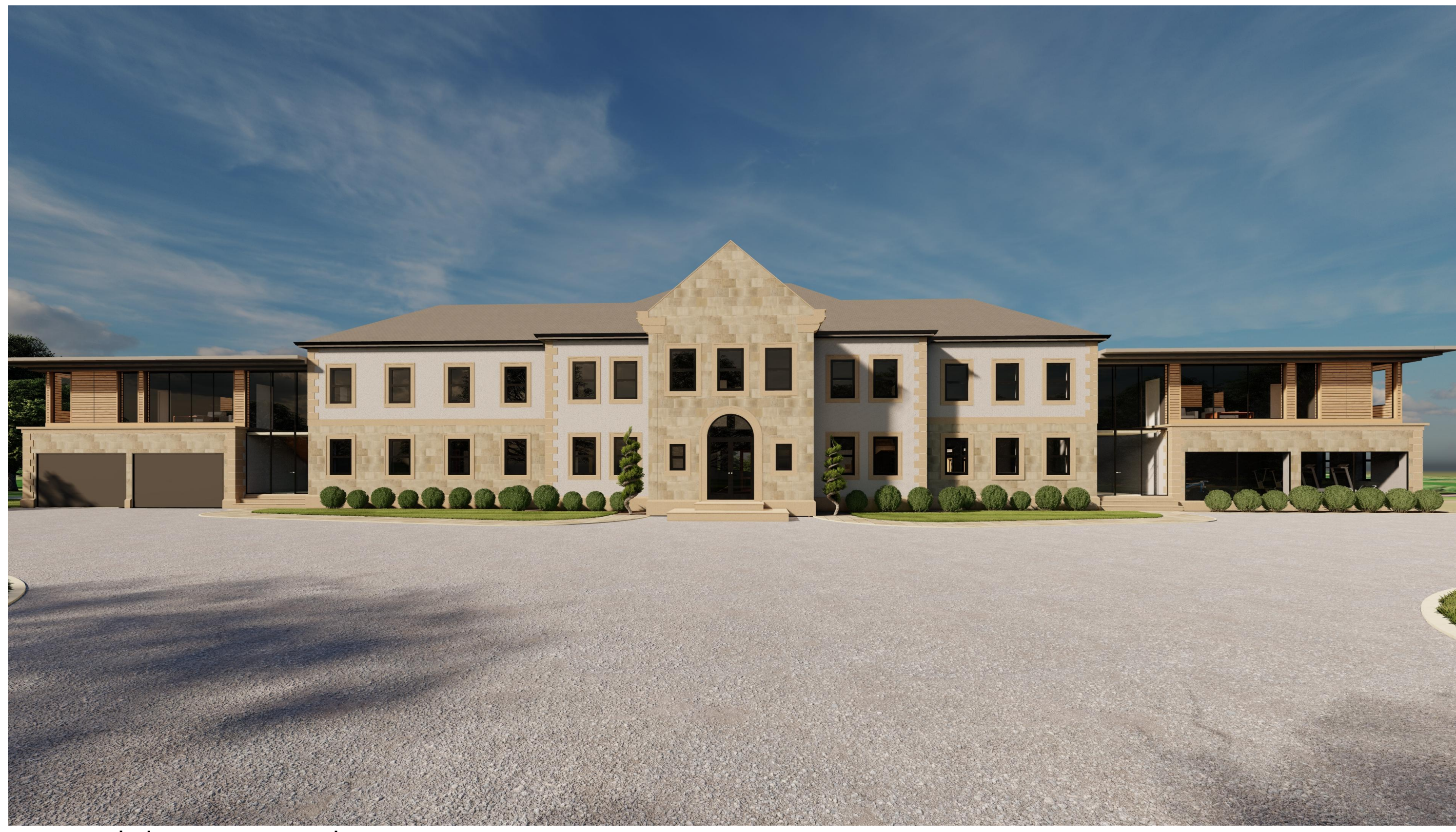
proposed view on approach