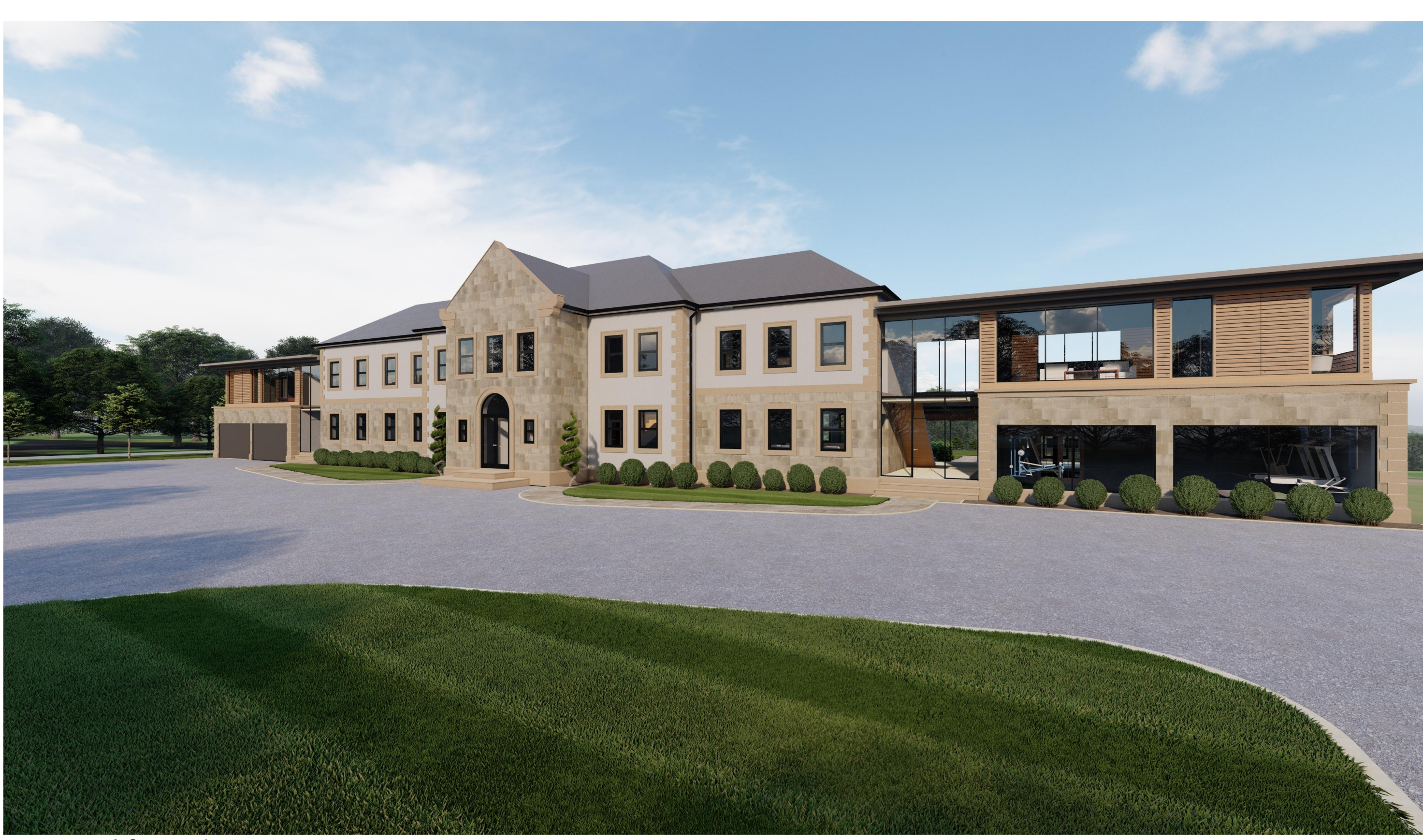
proposed front view